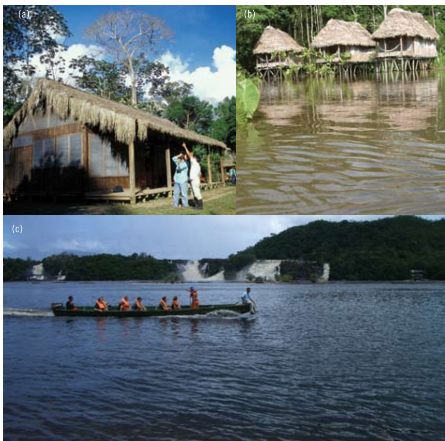
Figure 4.3. Ecotourism has enjoyed steady growth over the last two decades, providing economic opportunities for both the private sector and traditional communities: (a) Chalalan Ecolodge in Madidi National Park, Bolivia, (b) Kapawi Ecolodge and Reserve on the Pastaza River in Ecuador, and (c) Laguna Canaima in Canaima National Park, Venezuela.