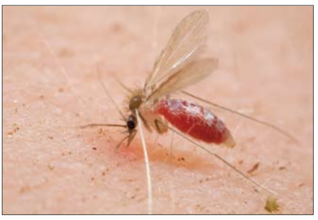
Figure 5.5. Previously rare diseases are spreading as human population increases in colonized areas, and pathogens adapt to changing environments. This sand fly ( Lutzomyia sp.) is the vector for the leshmaniasis parasite, now a common disease in colonized regions of Bolivia.

Manaus presents a stark contrast to other cities of the western Amazon. The prosperity in Manaus stems largely from the creation of a free trade zone and policies to promote economic growth. Manaus has experienced steady economic growth over four decades and created the only economy in the Amazon that