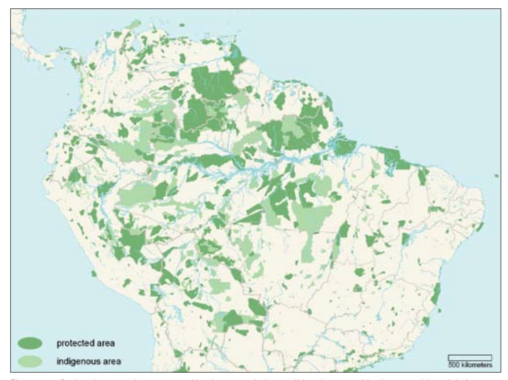
Figure 5.3. During the 1990s, large tracts of land were ceded to traditional communities in recognition of their historical claims to forest and aquatic resources; most of these lands are zoned for forest management and are an important complement to the protected area system throughout the Amazon.

The conflict between cattle ranchers and forest dwellers, including indigenous groups and immigrant populations descended from rubber tappers, gave birth to the environmental and social movement led by Chico Mendes, the peasant activist who was murdered in 1988 for challenging individuals engaged in land speculation (Hecht & Cockburn 1989, Cowell 1990). Since then,