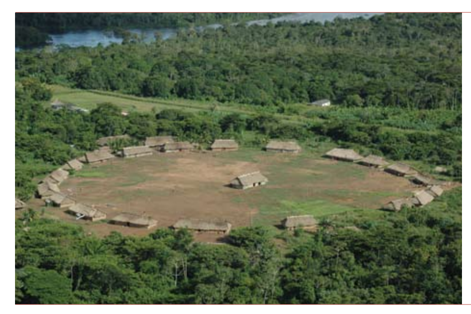
Round village of Kayapo Indigenous People. The Amazon is home to hundreds of traditional communities, including the Kayapo, who successfully maintained their cultural traditions.

People who live in the Amazon's rural areas are among the poorest inhabitants of the continent,<sup>74</sup> with some of the highest rates of illiteracy and worst health conditions in Latin America (IBGE, 2006). The region's poverty is partially the result of its geographic isolation. IIRSA investments in transportation infrastructure will greatly reduce this isolation and will undoubtedly promote economic growth and create new businesses opportunities and jobs—all of which will increase tax revenues and improve public services. Not surprisingly, most policymakers and the average citizen assume that the social impacts of IIRSA will be overwhelmingly positive. However, a more careful evaluation reveals that the distribution of these social effects will not benefit many of the region's current residents. Moreover, the relatively rapid introduction of economic and social change will generate a range of negative impacts in rural communities, including indigenous societies.