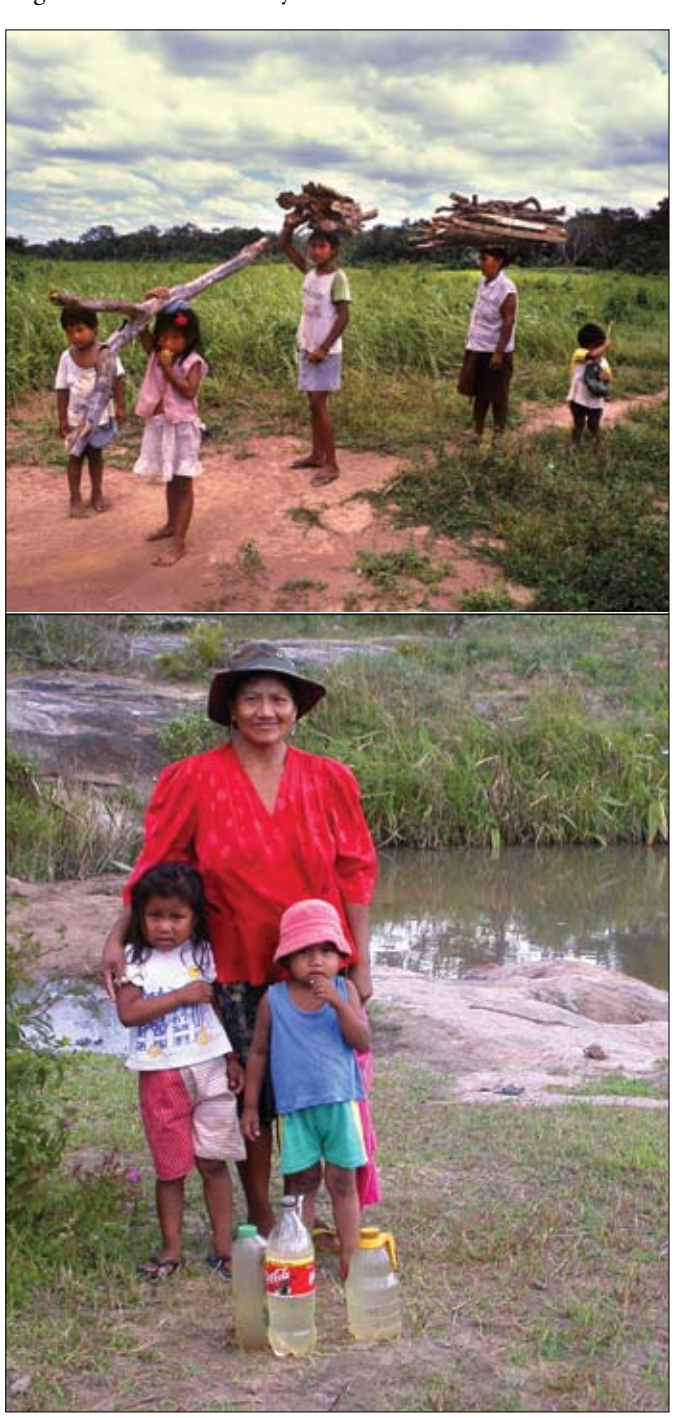
Figure 5.2. Many of the Amazon's rural communities are composed of indigenous groups or descendents of migrants who came to the Amazon during rubber or gold booms; most families lack basic services such as water and most depend on forest resources for food and fuel.

State land is literally up for grabs, and even protected areas and forest reserves are subject to invasion because the state has not effectively exercised its authority. In almost all instances, migrants and locals are fully aware that their land deeds have a