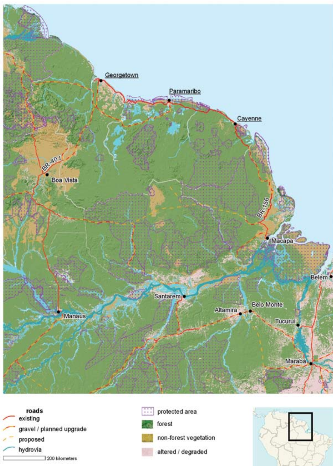
Figure A.3. The ArcoNorte refers to the highway system that will integrate the countries of the Guayana Shield in the northeastern Amazon. This sparsely populated region is generally considered to be the least threatened region of the Amazon, and large areas in Brazil have been designated as protected areas; however, the exploitation of the region's rich mineral and timber resources may become economically attractive following the completion of IIRSA investments.