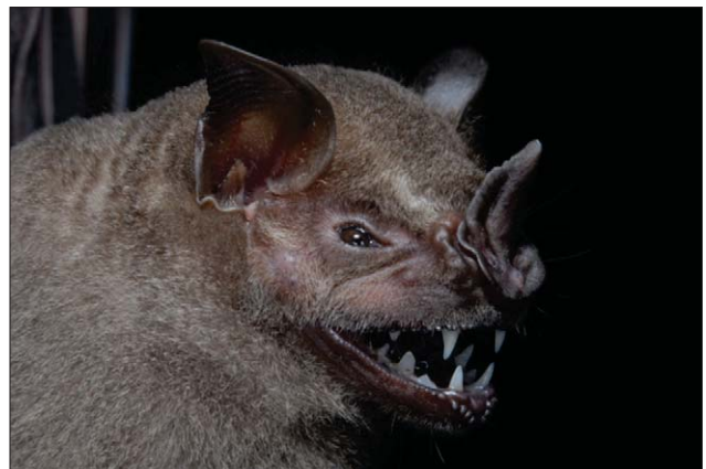
Figure 11.2. Larger fruit-eating bat ( Artibeus planirostris ).