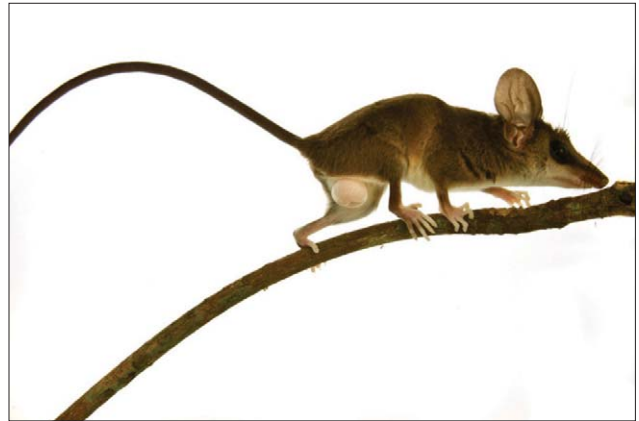
Figure 11.1. Delicate slender opossum ( Marmosops parvidens ) caught at the Upper Palameu site by Piotr Naskrecki.

bat, Lophostoma silvicolum [Figure 11.5]). By contrast, the 3 species of opossums were caught only once, each at one of the 3 different sites. For rats and mice, the Guianan terrestrial spiny rat ( Proechimys guyannensis ) was the most common with 5 captures but it was caught at only Site 2 in