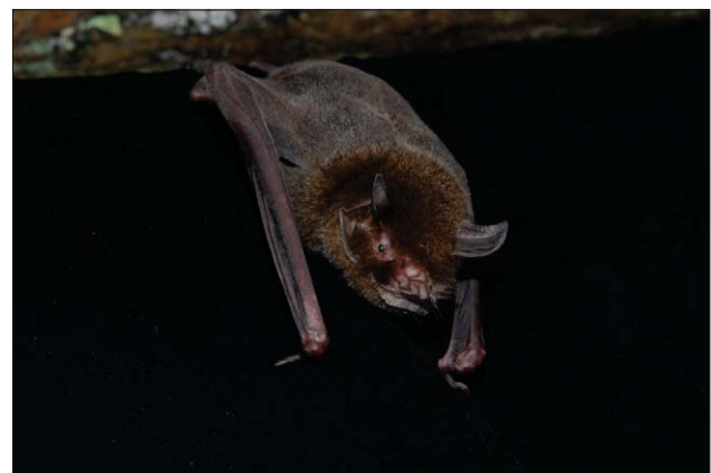
Figure 11.3. Common moustached bat ( Pteronotus parnellii ).