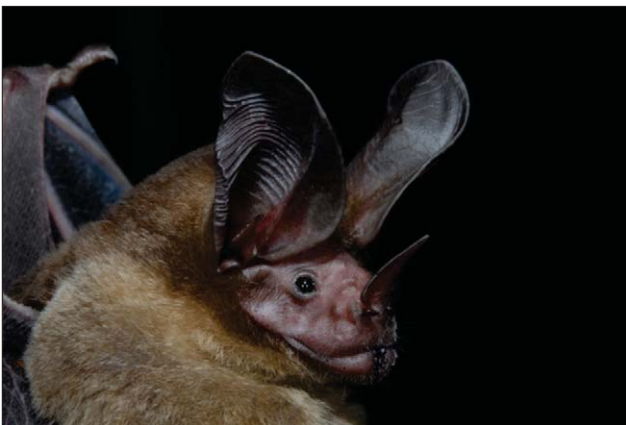
Figure 11.5. Round-eared bat ( Lophostoma silvicolum ).