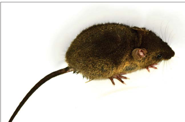
Figure 11.6. Water rat ( Nectomys rattus ) caught at the Grensgebergte site.

and snakes. The only rat that was caught at all 3 sites was the arboreal rice rat Oecomys auyantepui . The water rat Nectomys rattus (Figure 11.6) was also captured 3 times, but all were from the Grensgebergte Mountains site.