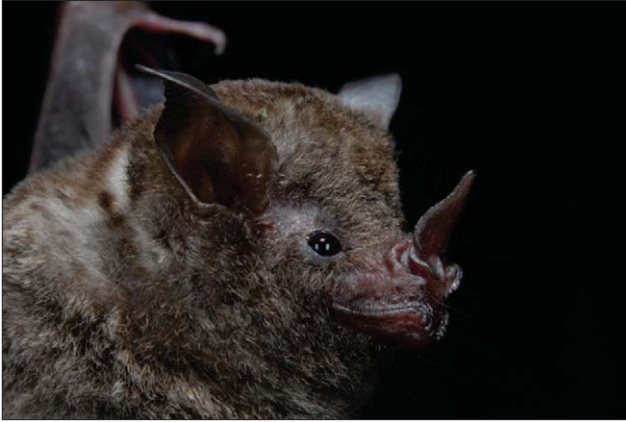
Figure 11.4. Seba's short-tailed fruit bat ( Carollia perspicillata ).

the Grensgebergte Mountains. The closely related Cuvier's terrestrial spiny rat ( P. cuvieri ) was one of the next commonest species with 3 individuals caught. These large rats (ca. 500 g) are prey for many top-level predators such as cats