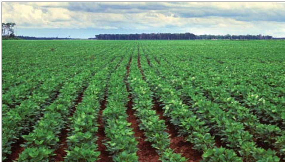
Figure 1.5. In a Utilitarian Scenario, an infusion of private capital would convert the Amazon into an agro-industrial powerhouse that provides the planet with food, fiber, and biofuels, while allowing for sustainable economic growth and social equity. Amazonian countries would develop technological solutions to overcome agricultural challenges such as soil infertility and weed control.

Because of the adverse impacts associated with similar investments in the past, IIRSA investments in infrastructure are viewed by many observers as a threat to the natural ecosystems of the Amazon and surrounding regions. Fortunately, most of the financial organizations involved with IIRSA have relatively high standards for environmental and social evaluation and usually condition loans on the implementation of environmental and social action plans. 5 Nonetheless, because infrastructure projects are being evaluated individually, 6 they fail to consider how the combination of projects and external forces such as global markets, transfrontier migration, or climate change might act synergistically to cause unforeseen effects. 7 The academic community has provided valuable insight into the potential future impacts and ample justification that a comprehensive evaluation procedure should be required for both IIRSA and PPA (Laurance et al. 2001, 2004, Nepstad et al. 2001, da Silva et al. 2005, Fearnside 2006b).