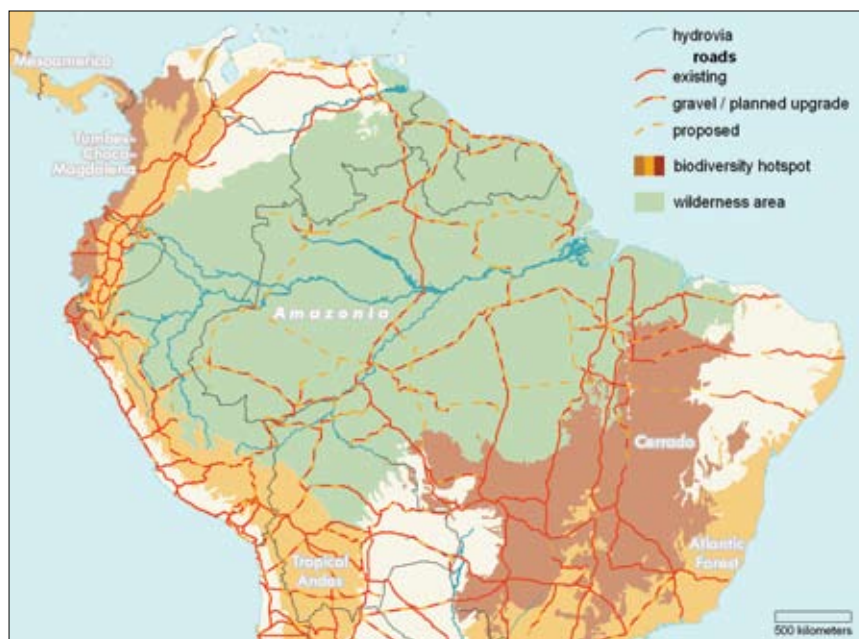
Figure 1.2. Principal IIRSA highway corridors and hydrovias are shown in the context of the Amazon Wilderness Area and the Cerrado and Andes Biodiversity Hotspots. Conservation International organizes priority action in these regions.