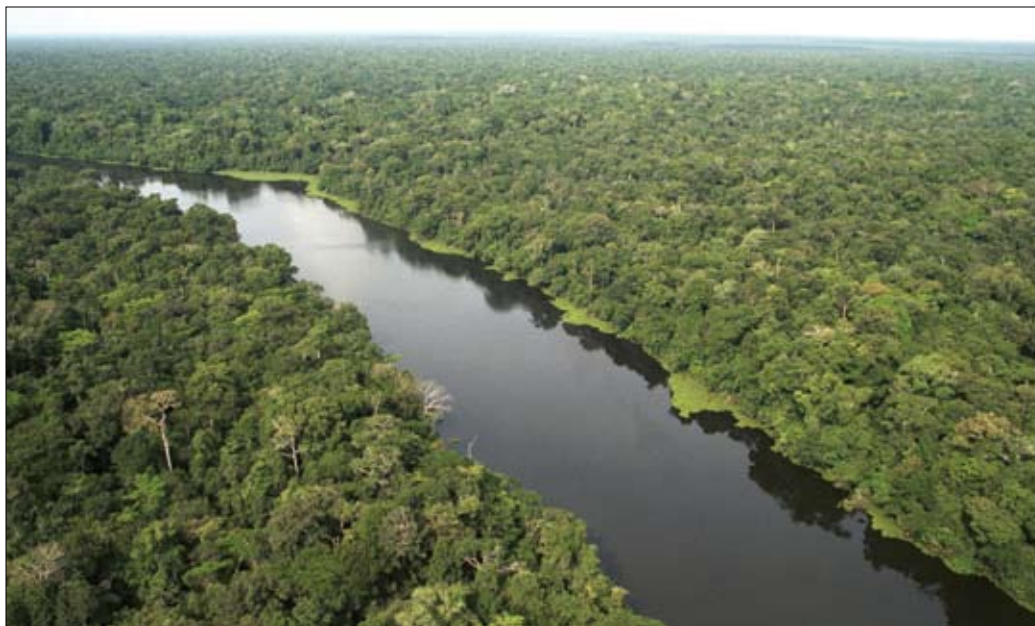
Figure 1.6. A Utopian Scenario would require an international agreement that compensates Amazonian countries for reducing carbon emissions caused by deforestation. Payments for ecosystem services would be used to fund health and education, and to subsidize production that avoids deforestation and forest degradation.