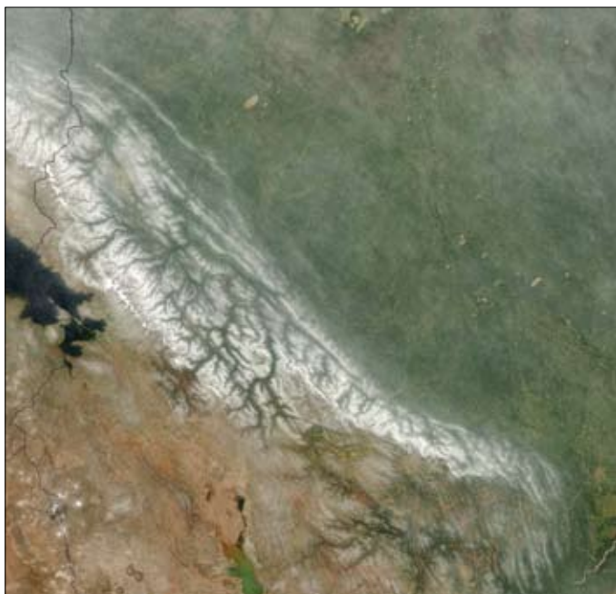
Figure 3.1. Cloud forests are unique habitats that vary according to local topography and wind flow; consequently, they are inherently fragmented and spatially complex as shown by this composite image of the Andean foothills in Bolivia. This image is derived from MODIS images taken at approximately 10:30 and 13:30 local time from the NASA Terra and Aqua satellites. White areas are those with frequent cloud cover.

thus, habitat diversity and species turnover are prominent attributes of this ecosystem.