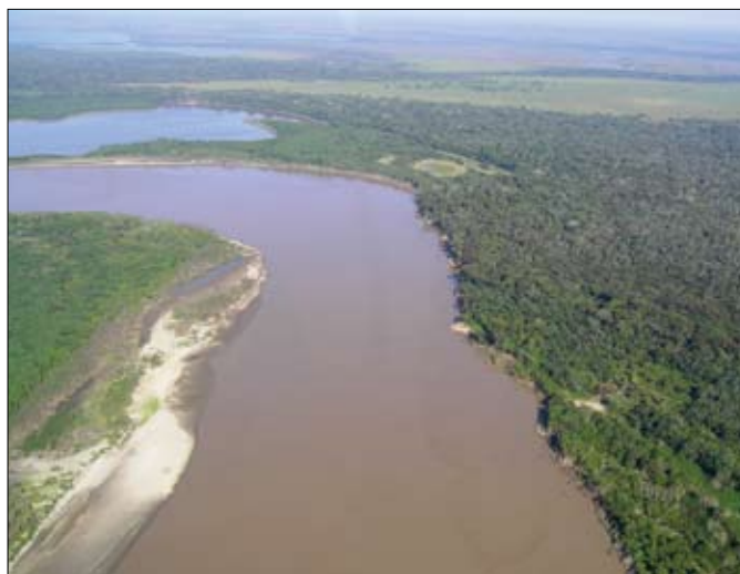
Figure 3.6. The inundated forests of the Amazon are strategically important for biodiversity conservation: (a) Igapo forest near Manaus is home to plant and animal species adapted to the acidic conditions of black water rivers; (b) Varzea forests have muddy, nutrient-laden waters and are among the most productive wetlands in the world.