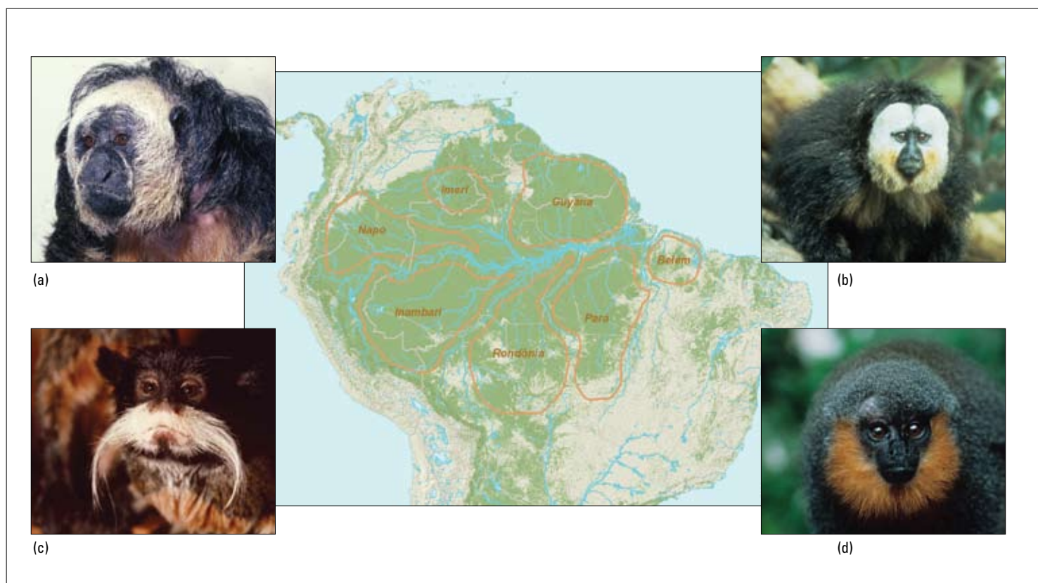
Figure 3.3. The Amazon has different biogeographic regions, each characterized by endemic vertebrates: (a) Equatorial saki ( Pithecia aequatorialis ) is endemic to the Napo region in Ecuador and northern Peru; (b) White-faced saki ( Pithecia pithecia ) is endemic to the Guayana region; (c) Emperor tamarin ( Saguinus imperator ), is endemic to the Inambari region and (d) Prince Bernhard's titi monkey ( Callicebus bernhardi ) is endemic to a restricted area in the Rondonia region. Deforestation has already severely affected the eastern and southern regions, while IIRSA investments will impact the Inambari and Napo regions.