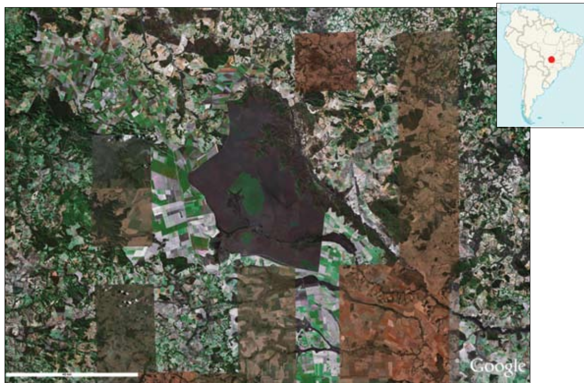
Figure 3.5. Emas National Park is an island of native habitat surrounded by farmland in the Cerrado. Gallery forests along rivers and scattered remnants of native habitat provide opportunities for a regional conservation strategy (Google Earth™ Mapping Services).

IIRSA and PPA investments will accelerate habitat degradation in most, if not all, of the extra-Amazonian ecosystems. The Cerrado Biodiversity Hotspot is the most endangered due largely to its suitability for mechanized agriculture. Although the Federal Government of Brazil makes repeated commitments to conserve the Amazon, similar actions to conserve in the Cerrado region are weighed against national priorities to expand agricultural production (Figure 3.5). Thus, although the Amazon ecosystem faces extensive degradation and fragmentation due to IIRSA investments over the medium term, the Cerrado faces virtual annihilation over the next half century (Machado et al. 2007). Considering the advanced state of the destruction of this biome, protected area creation should be part of any strategy that seeks to mitigate the effects of the PPA's investments in modern highways. The Brazilian forest code requires that 20 percent of private properties be left as native habitat within the Cerrado biome. These efforts to conserve gallery forests within private lands could significantly