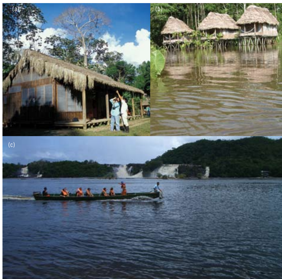
Figure 4.3. Ecotourism has enjoyed steady growth over the last two decades, providing economic opportunities for both the private sector and traditional communities: (a) Chalalan Ecolodge in Madidi National Park, Bolivia, (b) Kapawi Ecolodge and Reserve on the Pastasa River in Ecuador, and (c) Laguna Canaima in Canaima National Park, Venezuela.