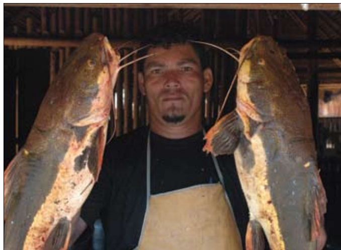
Figure 4.1. Fisherman with migratory Jau Catfish ( Zungaro zungaro ) which, like most Amazonian catfish, is vulnerable to watershed fragmentation from dams and reservoirs. Fishing is the most important economic activity in the Amazon that is wholly dependant on biodiversity. It provides financial opportunity to fishermen, as well as to boat builders, mechanics, and fishmongers.

Fish and wildlife resources illustrate the first constraint. Fishing is the most important and stable component of the Amazonian economy, providing employment and sustenance to an overwhelming majority of its residents, either directly by subsistence fishing or indirectly by commercial and sport fishing (Figure 4.1). The commercial fishing industry in the Brazilian Amazon produces at least $100 million in annual revenues while providing more than 200,000 direct jobs; these statistics do not include related sectors such as boat building, tourism, mechanical shops, and other services (Almeida et al. 2001, Ruffino 2001). There is much concern about the sustainability of current fishing practices, particularly on the main trunk of the Amazon River where human population is relatively dense (Goulding & Ferreira 1996, Ruffino 2001, Jesús & Kohler 2004). Remote regions with fewer human residents still have relatively robust fish populations (Chernoff et al. 2000, Silvano et al. 2000, Reinert & Winter 2002). IIRSA investments in hydrovias will probably lead to higher population densities along rivers and to an increase in overfishing if appropriate management procedures are not implemented. Unfortunately, most Amazonian fishermen are impoverished and would probably never be convinced to pay for the right