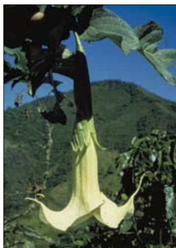
Figure 4.2. The tree datura [ Brugmansia arborea (L.) Lagerh.] is used by Andean shamans for its curative and hallucinogenic properties; the active ingredients are tropane alkaloids, mainly scopolamine, which has multiple pharmaceutical uses, including pupil dilation and as a treatment for motion sickness. Like many pharmaceuticals, the intellectual property rights of these compounds are in the public domain because they come from centuries of prior use and knowledge.

Thus, even though the importance of natural products and the intrinsic value of biodiversity have been reaffirmed as an economic asset, the cost associated with research, drug development, and the mechanics of the marketplace make it unlikely that civil society will be able to require pharmaceutical companies to monetize that value in any meaningful way. Even if the countries of the Andes and Amazon were willing to open their forests for unlimited pharmaceutical prospecting, it is unlikely that the major pharmaceuticals would make any significant investments, and certainly not on the scale necessary to create an economic incentive to conserve the Amazon.