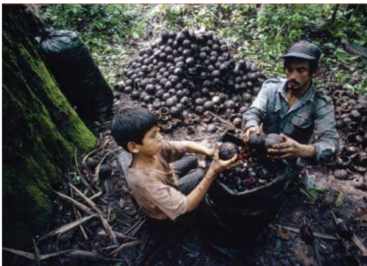
The collection and processing of Brazil nuts is considered by many to be the quintessential sustainable forest enterprise and is the mainstay of many traditional communities.

The Amazon Wilderness Area and the Tropical Andes and Cerrado hotspots provide ecosystem services to the world via their biodiversity, their carbon stocks, and their water resources. It is difficult to estimate the economic value of these resources due to their intangible nature and the tendency of traditional economists to discount goods and services that cannot be monetized in a traditional market (Costanza et al. 1997). One method of valuating ecosystem services is to estimate their replacement costs; simply put, how much would it cost human society to replace those good and services or, if they are irreplaceable, how much wealth has been lost? (Balmford et al. 2002). Regardless of how difficult it is to measure precisely, there is overwhelming agreement that ecosystem services are extremely valuable to society at global and continental scales alike, although market mechanisms and human nature tend to discount or even disregard that value when individual decisions are made at the local scale (Andersen 1997). The growing concern over global climate change and biodiversity extinction has stimulated efforts to estimate the value of ecosystem services and to create mechanisms whereby communities that choose to conserve natural habitats are compensated by other communities that enjoy the benefits of those services (Turner et al. 2003).