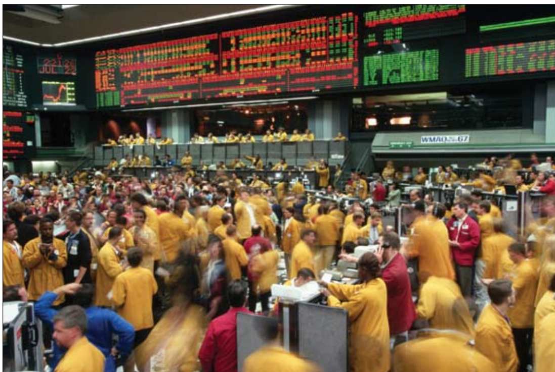
Figure 4.4. Carbon credits are increasingly being treated as a commodity, and proposals to certify reductions in emissions from deforestation (RED) may soon be approved for trading on international markets.