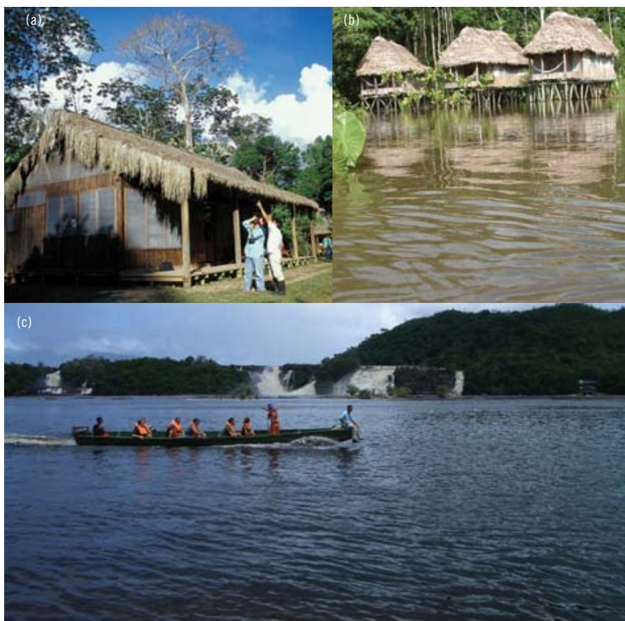
Figure 4.3. Ecotourism has enjoyed steady growth over the last two decades, providing economic opportunities for both the private sector and traditional communities: (a) Chalalan Ecolodge in Madidi National Park, Bolivia, (b) Kapawi Ecolodge and Reserve on the Pastasa River in Ecuador, and (c) Laguna Canaima in Canaima National Park, Venezuela.