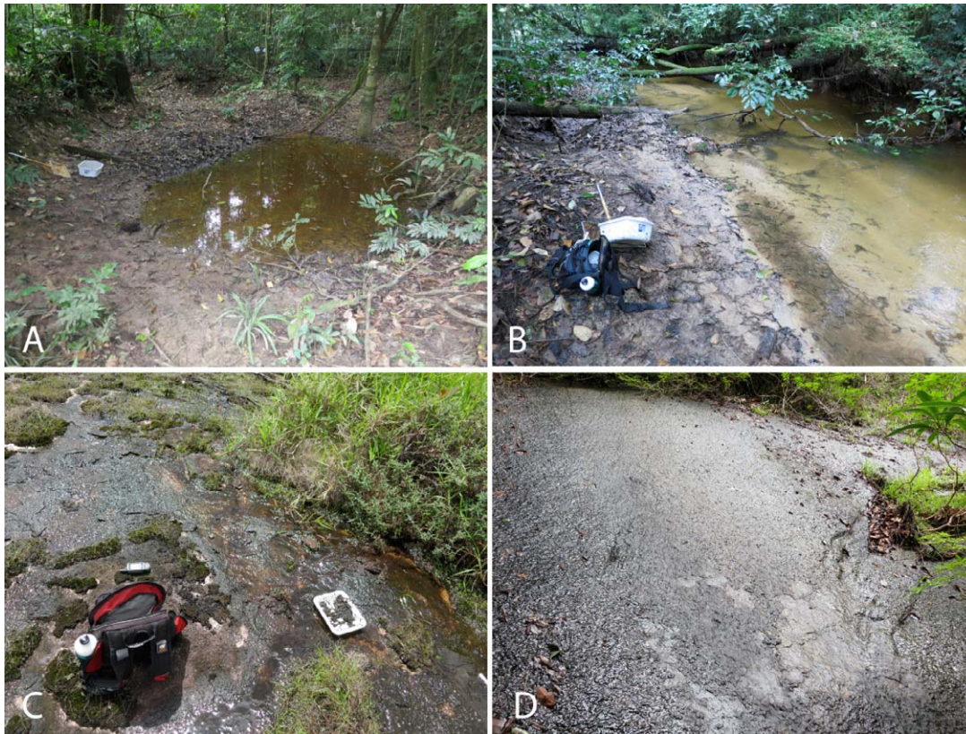
Figure 4.1. Selected collecting event photographs, with field numbers given in brackets. A) Camp 1, detrital pool along floodplain of small upper Palumeu tributary [SR12-0311-01A], B) Camp 1, tributary of the upper Palumeu [SR12-0314-01A], C) Camp 2, typical seepage habitat on the Grensgebergte summit [SR12-0312-01A], D) Camp 4, large flowing seepage near the base of Kasikasima [SR12-0324-01C].

Most collecting was done along a cut trail south that continued to the Brazilian border, and in the immediate (<1 km) vicinity of basecamp. Along the trail a few kilometers south