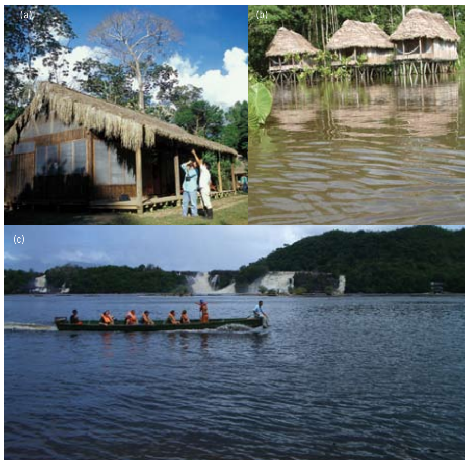
Figure 4.3. Ecotourism has enjoyed steady growth over the last two decades, providing economic opportunities for both the private sector and traditional communities: (a) Chalalan Ecolodge in Madidi National Park, Bolivia, (b) Kapawi Ecolodge and Reserve on the Pastaza River in Ecuador, and (c) Laguna Canaima in Canaima National Park, Venezuela.