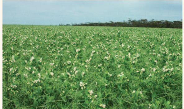
(b) Field peas at late flowering, early podding