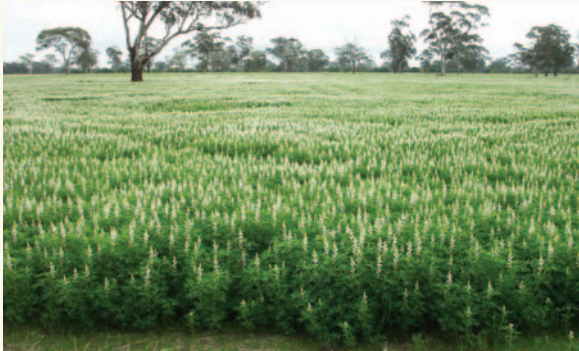
(a) Lupins