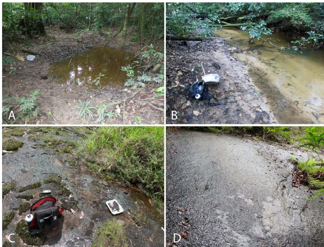
Figure 4.1. Selected collecting event photographs, with field numbers given in brackets. A) Camp 1, detrital pool along floodplain of small upper Palumeu tributary [SR12-0311-01A], B) Camp 1, tributary of the upper Palumeu [SR12-0314-01A], C) Camp 2, typical seepage habitat on the Grensgebergte summit [SR12-0312-01A], D) Camp 4, large flowing seepage near the base of Kasikasima [SR12-0324-01C].

Most collecting was done along a cut trail south that continued to the Brazilian border, and in the immediate (<1 km) vicinity of basecamp. Along the trail a few kilometers south