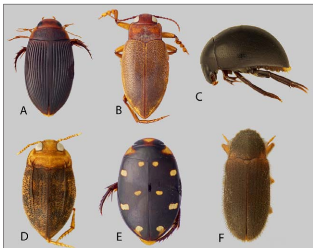
Figure 4.3. Selected habitus images of aquatic beetle taxa collected in the Grensgebergte and Kasikasima regions. A) Copelatus sp., B) Vatellus grandis , C) Derallus sp., D.) Anodocheilus sp., E) Platynectes sp., F) Dryops sp.

There were almost 10% more species collected during this RAP than the previous one around Kwamalasamutu, on which 144 species were recorded (Short and Kadosoe 2011). This is striking because far fewer overall specimens were collected (c. 2500 vs. >4000), in large part because of reduced manpower (one collector vs. two for Kwamalasamutu). Amazingly, more than 40% of the species (69) collected during this RAP were not collected at Kwamalasamutu. Some species that were extremely abundant in Kwamalasamutu (e.g. Enochrus sp. 1, Notomicrus , Thermonectus ) were generally rare on this RAP. In some cases, such as with the majority of seepage taxa, this can be attributed to availability of suitable habitat. In other cases, it may be due to seasonality