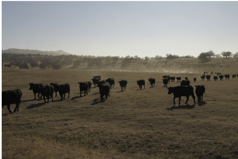
Figure 1. Extreme drought on California's annual rangelands (Sutter County, California). At the time of this photo (January 2014), drought conditions were extreme to exceptional for 67% of the state. 4

characteristically long, hot, and dry summers during which dryland forage quality declines over the season. Escalating drought frequency and severity compound this challenge, delaying or eliminating the fall, winter, and spring rains that lead to renewed green forage. Long-term drought poses significant, cumulative challenges to sustaining ranching operations and the ecosystem goods and services they provide. Severe and widespread drought can trigger undesirable ecological shifts, which can have long-term impacts on forage and livestock production and directly threaten livelihoods of families and communities.