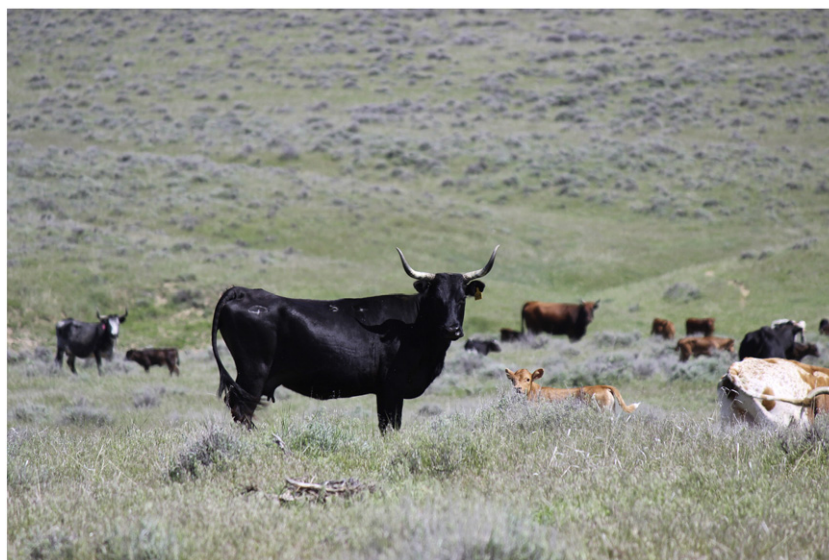
Figure 2. Breeds of cattle such as Corrientes that are adapted to arid and semi-arid conditions have been integrated into grazing operations for hardiness and to capture an alternative market for rodeo stock. Picture from west of Bill, WY in 2015.

evaluating DNA markers in dairy cattle to identify chromosomes associated with productivity relative to temperature-humidity indices. 23 A similar approach for beef cattle has been used to assess heat-tolerant (Romosinuano breed) and heat-susceptible (Angus breed) cattle and indicates that prolactin (an endocrine marker) influences cow heat tolerance. 24 Thus, advances in capitalizing on heat tolerance could be advantageous for all areas forecasted to become warmer and regardless of disagreement between precipitation forecasts. Most simply, managers should consider hide color and breed composition to better cope with heat stress, especially in open rangelands that do not have readily available shade resources. However, only focusing on heat tolerance may be overly simplistic, especially in northern areas that experience cold winters because traits that dissipate heat well may decrease cold tolerance and challenge thermal regulation in the winter—a major concern for maintaining body condition.