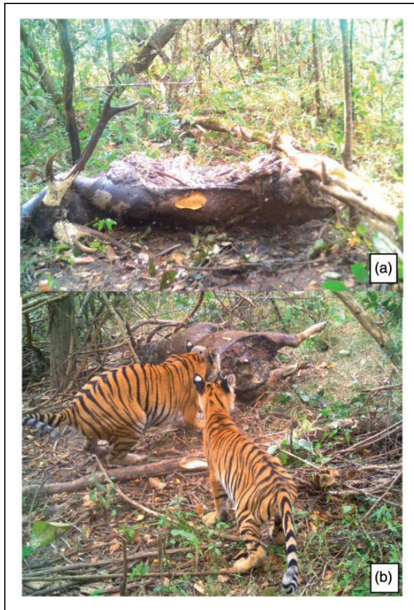
Figure 2. (a) We found this sambar kill by visiting sites where a tiger was located three or more times in consecutive 1 hr GPS fixes. (b) We occasionally placed camera traps at kill sites to obtain additional information on a tiger's condition and, for females, their reproductive status.