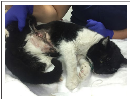
Figure 1 Patient after hospital admission, showing an abnormal posture (back kyphosis, retracted abdomen)

Methadone (0.2 mg/kg IV q6h) and metamizole (25 mg/kg IV q8h) were used for analgesia, avoiding the use of non-steroidal anti-inflammatory drugs (NSAIDs) owing to safety concerns and unknown patient status at admission. Blood test abnormalities indicated neutrophilia (16,575/ \mu l; reference interval [RI] 2500–12,500/ \mu l), lymphopenia (1365/ \mu l [RI 1700–7000/ \mu l]), monocytosis (1170/ \mu l [RI 0–850/ \mu l]) and a slight increase in gamma-glutamyl transferase (17 U/l [RI 0–8 U/l]). When reassessing pain, mechanical allodynia was evidenced by an extreme reaction when the skin was lightly rubbed and stroked with fingers or a gauze, and thermal hyperalgesia was revealed as marked sensitivity when placing an icepack (Figure 1).