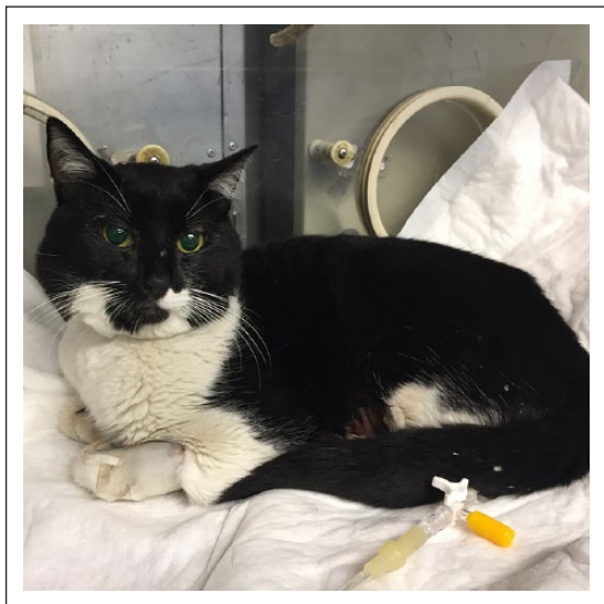
Figure 4 Twenty-four hours postoperatively (6 points on UNESP-botucatu multidimensional composite pain scale)