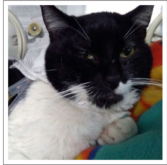
Figure 5 Forty-eight hours postoperatively and after the removal of the wound catheter (12 points on UNESP-Botucatu multidimensional composite pain scale)