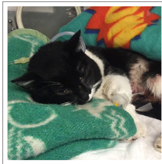
Figure 2 Patient during anesthesia recovery with 15 points on the UNESP-Botucatu multidimensional composite pain scale

The procedure was performed 24 h after admission and lasted 2 h. Surgery corrected the hernia, resecting 1 \times 2 cm of muscular wall and releasing the intestine (duodenum and jejunum) that was attached to the abdominal wall. The anesthetic protocol consisted of methadone (0.2 mg/kg IV), ketamine (2.5 mg/kg IV)/midazolam (0.25 mg/kg IV), maintenance with isoflurane and an epidural injection (bupivacaine 0.5%: 0.3 ml/kg; morphine: 0.1 mg/kg). Upon skin and muscle incision, the patient showed a sympathetic response (tachycardia, hypertension and tachypnea). Fentanyl (5 \mu g/kg/h) and ketamine (0.6 mg/kg/h) constant rate infusion (CRI) was initiated; tachycardia (204 bpm) and