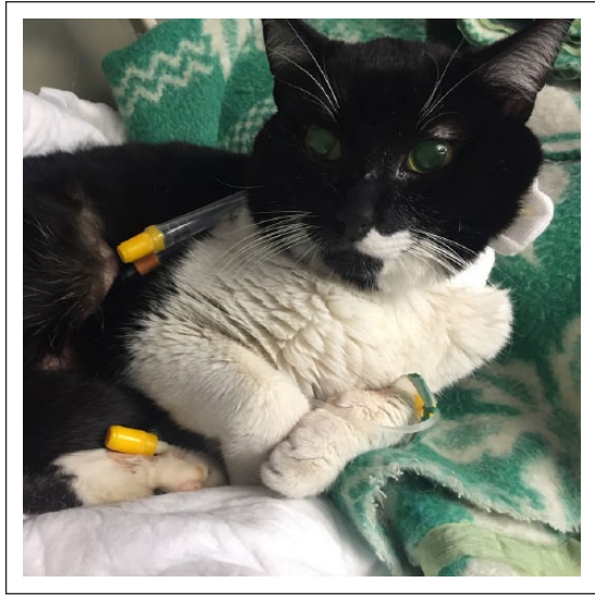
Figure 3 Patient after multimodal analgesia (12 points on UNESP-Botucatu multidimensional composite pain scale)