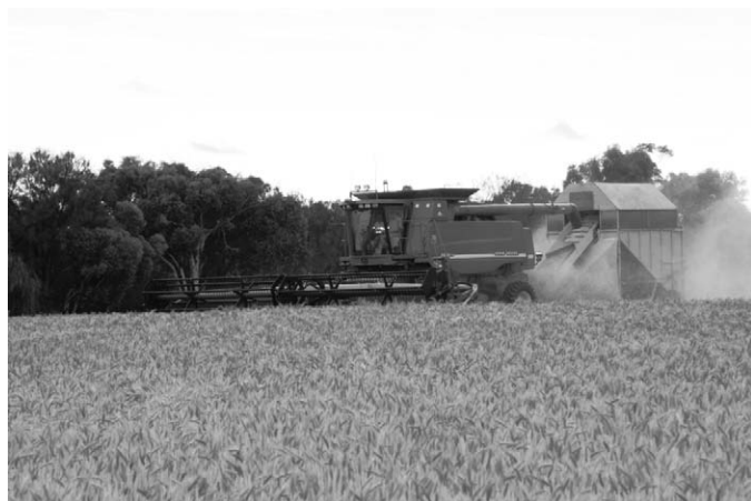
Figure 1. Chaff cart system in operation during commercial wheat crop harvest.

how a major herbicide-resistant weed problem has been the catalyst for the development of new non-chemical weed control techniques focused on weed seed capture and destruction during commercial grain crop harvest. We illustrate how the inclusion of these techniques in weed control programs allows weed populations to be driven to and maintained at very low levels. Finally, we speculate on the potential for at-harvest weed seed targeting technologies in global field crops.