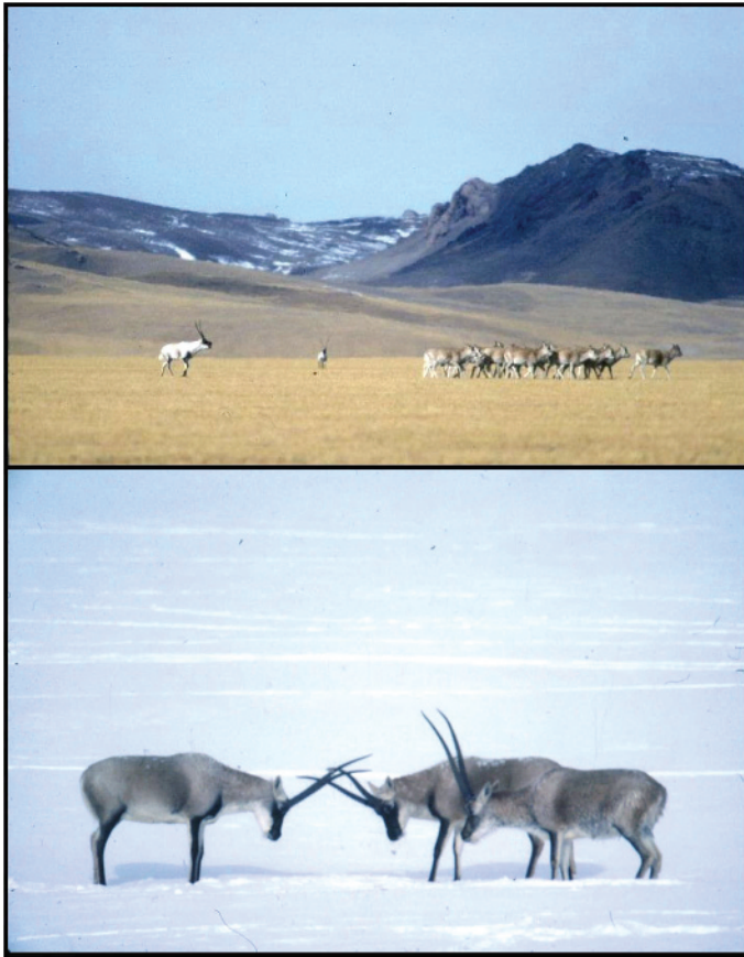
Fig. 6. —Mature male Pantholops hodgsonii tending a harem in December with a typical Tibetan backdrop (top), and mature males sparring, Qinghai, late October (bottom).

Among 1,000 male P. hodgsonii dispersed in the Aru Basin of the Chang Tang Nature Reserve in summer 1992, mean group size was 6.6 individuals (range: 1–82 individuals, 50% of groups 2–20 individuals); during autumn and spring migration, female herds can exceed 1,000 individuals, but they disperse into small groups of generally \leq 20 individuals, with as many as 15–20% of females occurring singly (Schaller 1998). Yearling males begin to leave their mothers at 10–11 months of age and associate more regularly with males of their own age or older (Schaller 1998).