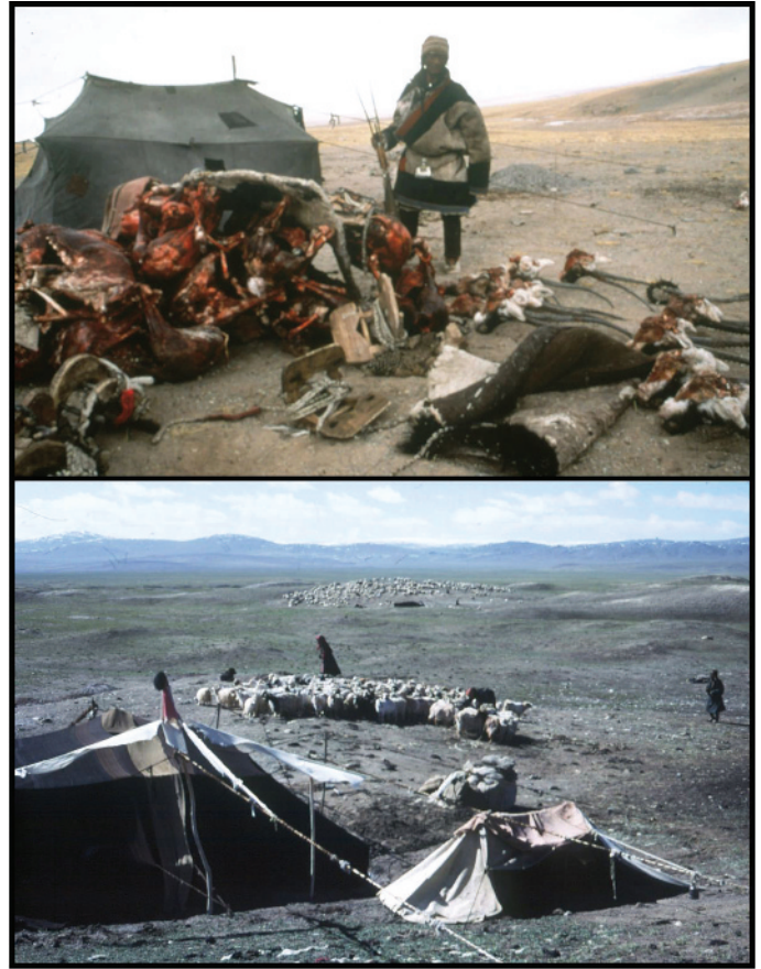
Fig. 7. —Poacher's camp with a pile of carcasses and heads of Pantholops hodgsonii in Tibet, December (top), and nomad tents and herds of sheep and goats occupy traditional range of P. hodgsonii in western Tibet, July (bottom).