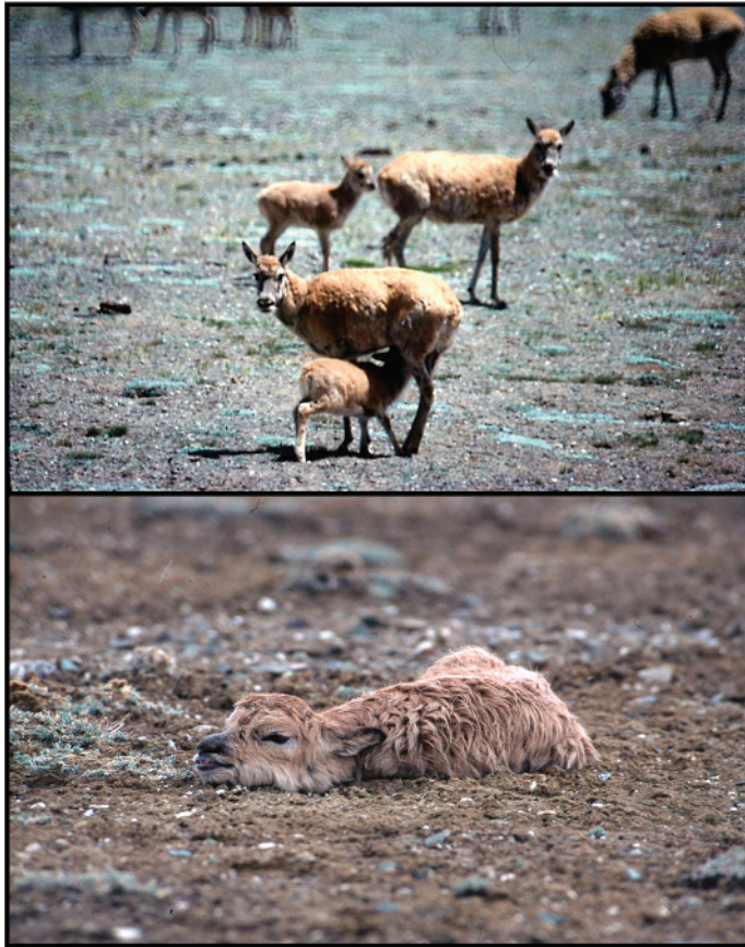
Fig. 4. —One-month-old Pantholops hodgsonii suckling in early August (top), and a newborn calf laying in open steppe habitat in late July (bottom), Tibet.

status of P. hodgsonii , cloning has been investigated using goat and rabbit oocytes, with some blastocyst development noted (Zhao et al. 2006, 2007).