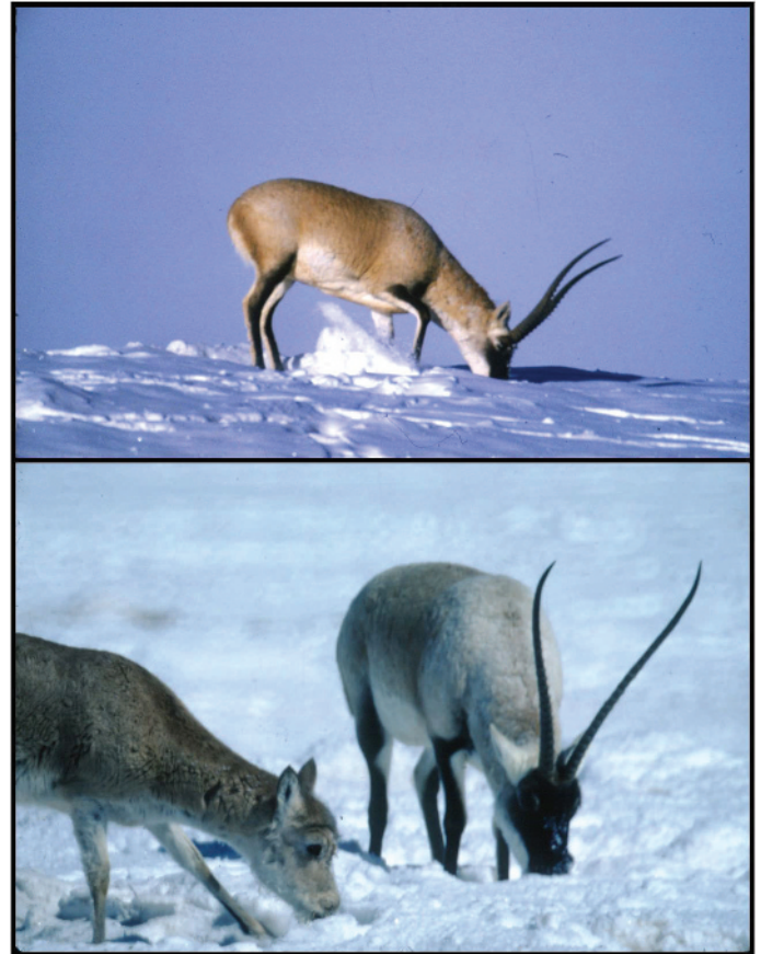
Fig. 5. —Adult male Pantholops hodgsonii pawing for scant forage (top), and adult male and female foraging in snow (bottom), Qinghai, late October.

Diets. — Pantholops hodgsonii is an herbivorous ruminant. Foraging preferences are understood mainly from limited microhistological analyses of feces (Cao et al. 2008; Harris and Miller 1995; Schaller 1998). P. hodgsonii is a mixed feeder (Cao et al. 2008), seasonally eating grasses, sedges, forbs, and select parts of dwarf woody vegetation, although dietary diversity is constrained substantially by limited forage availability and diversity on the Tibetan Plateau (Schaller 1998). In Chang Tang Nature Reserve, annual percent use of various plants is graminoids: Stipa , 3.7–47.3%; Kobresia , 1.1–33.1%; Carex moorcroftii , 0.5–22.8%; herbaceous plants: Potentilla bifurca , 0.3–31.1%, Leontopodium , 0.2–11.9%; and dwarf shrubs: Ceratoides compacta , 0.2–63.5%, Ajanía fruticulosa , 21.2% (Schaller 1998).