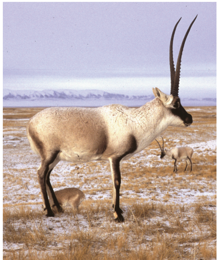
Fig. 1. —Mature male Pantholops hodgsonii in nuptial pelage, Qinghai Province, China, November 2006.

CONTEXT AND CONTENT. Order Artiodactyla, suborder Ruminantia, family Bovidae, subfamily Caprinae, tribe variously Pantholopini or Saigini. Pantholops is monotypic. Hodgson (1834) aligned P. hodgsonii with the “Antilopine” and “Gazelline” groups, but Gray (1872) created a new family, Pantholopidae, because of its “peculiarities” (Pocock 1910:899). Current molecular and morphological studies align P. hodgsonii most closely with Caprinae (e.g., Gatsey et al. 1997; Gentry 1992), although some contend that additional genetic resolution needs to be achieved (Lei et al. 2003; Schaller and Amato 1998). Based on behavior and various morphological characteristics, Vrba and Schaller (2000:220) concluded that Pantholops “has no close recent relatives and represents an ancient lineage that diverged during the Miocene from the closest living forms [Caprinae].” Grubb (2005) placed P. hodgsonii in the subfamily Caprinae.