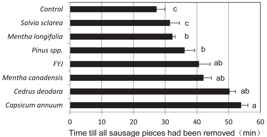
Fig. 3. Effect of plant essential oils on the time (min) required by Solenopsis invicta workers to remove all 8 of the ~62.5 mg fragments of sausage placed on a piece of filter paper treated with an essential oil. Each piece of filter paper was placed 15 cm from the perimeter of the fire ant mound. FYJ is a mixture of menthol, methyl salicylate, camphor, eucalyptus oil and eugenol. Means ( \pm SE) followed by the same letter are not significantly different (LSD) at level of 0.05.

tested. The concentration of essential oils used in this experiment was 10^{-6} ml/ml, but different concentrations may alter the effectiveness of a repellent (Chen 2009). Future research should consider this possibility. Our study also revealed that the number of worker ants involved in foraging activities tended to increase over time. This may be due to the gradual decrease of the repellent effect of essential oils. It is probable that lower repellency occurred because the outdoor air-flow accelerated the evaporation of the essential oils. Perhaps micro-capsules could be developed to ensure a greater stability of the repellent effects.