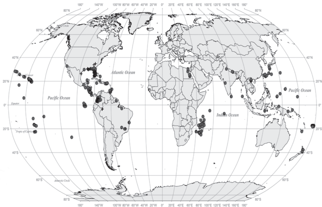
Fig. 2. Worldwide distribution records of Cardiocondyla minutior . Circle = C. minutior record. + = unconfirmed New World ' C. nuda ' record.