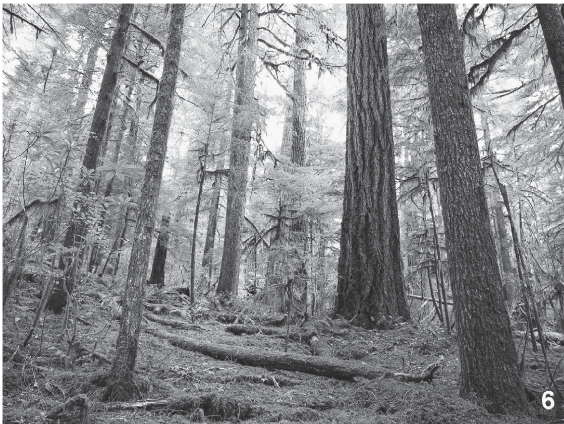
Fig. 6. Old-growth forest of Tsuga heterophylla zone, “Cougar 1” site, type locality of Paleonura saproxyllica sp. nov.

bulb bilobate. Chaetotaxy of antennae as in Table 1b. Buccal cone relatively long and rounded at apex. Maxilla needle-like, mandible tridentate. Labium with 11+11 chaetae, labial papillae x absent. Labrum chaetotaxy 2/4, 4. Group Vi of ventral side with 6+6 chaetae. Groups Vea, Vem and Vep with 4, 3 and 4 chaetae respectively. Dorsal chaetotaxy of the head as in Table 1a and Fig. 1. Dorsal chaetotaxy of central area on head complete, with 3 chaetae Oc and chaetae A, B, C, D, E, F, G, O. The line of setae Di2–De2 crosses the line Di1–De1 on head (the cross-type, Deharveng 1983). Eyes absent.