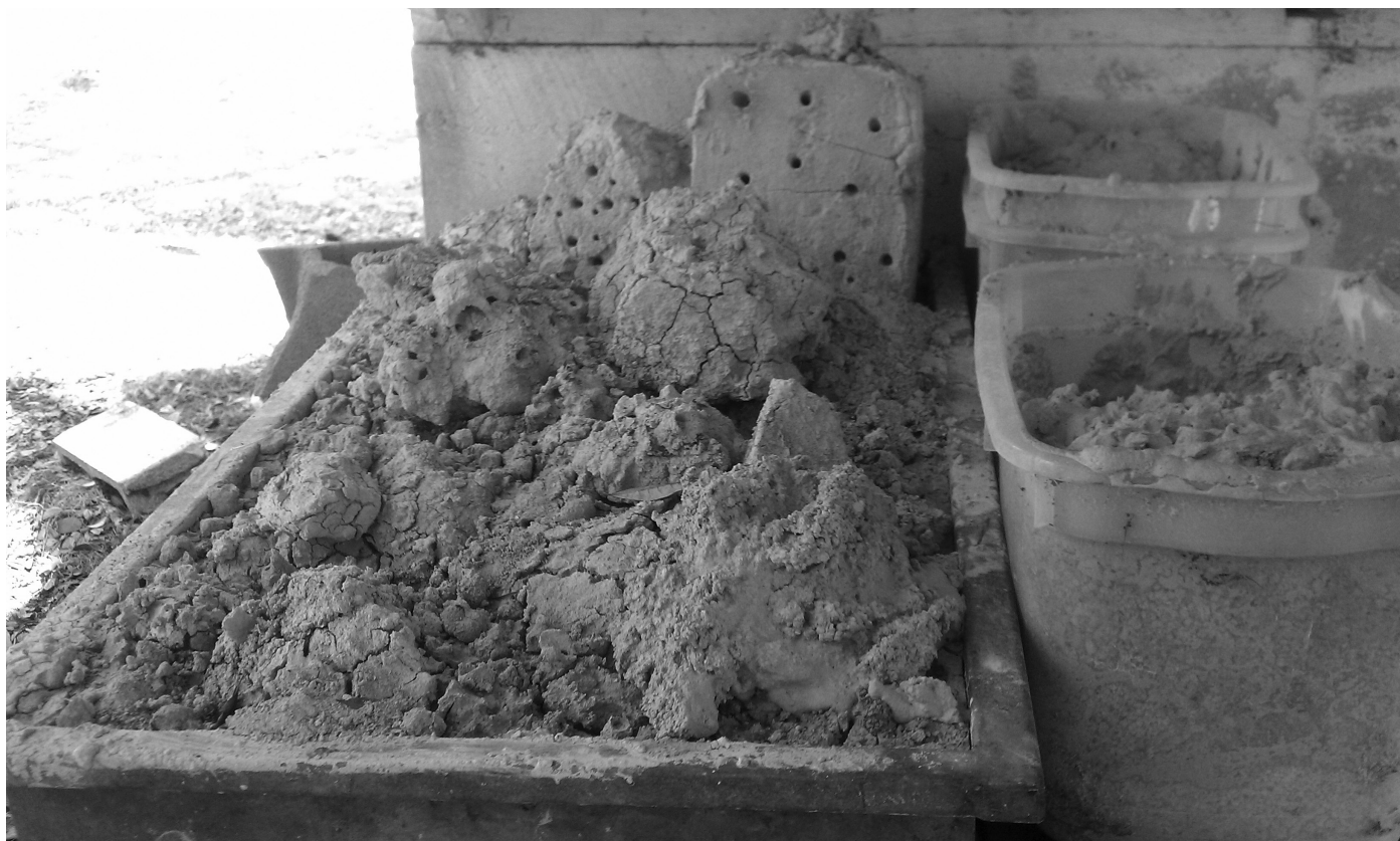
Fig. 2. The 1st daughter nesting aggregation of Anthophora abrupta established 10.3 km from the original nest site in Gainesville, Florida. It was created as a split from the mother nesting aggregation in Mar 2012.

In Apr 2014, the nest aggregations were observed in anticipation of emerging adult A. abrupta . At the mother nest aggregation, on Apr 21, a faint crackling sound in the clay was noted, and adult A. abrupta bees were observed emerging at the mother site on Apr 26, 2014. At the 1st daughter site, the adults were seen emerging on Apr 28, 2014. Adults were not observed emerging at the 2nd daughter site until Apr 30, 2014. Nesting by A. abrupta continued at the mother site and 1st