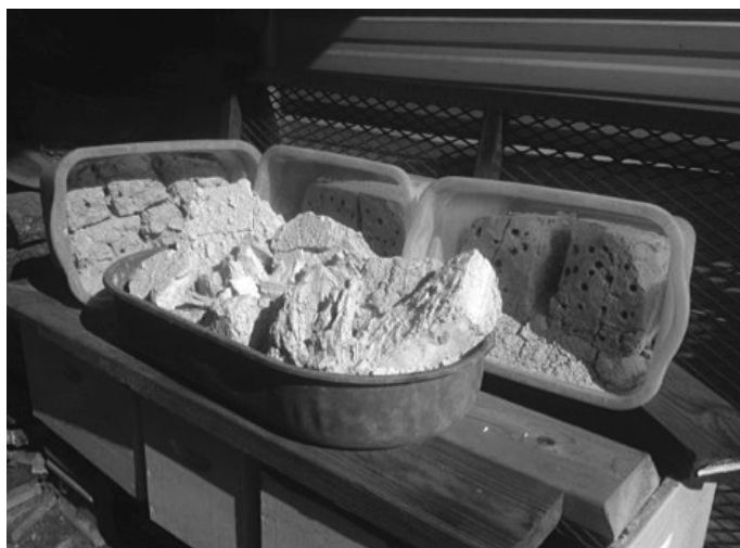
Fig. 3. A 2nd daughter nesting aggregation of Anthophora abrupta established 35.7 km from the original nest site in Gainesville, Florida. It was created as a split from the mother nesting aggregation in Mar 2014.

Our observations at the daughter nest aggregations suggest that we were able to establish 2 new nest aggregations of chimney bees successfully. Flight activity at the daughter nest sites was lower than that at the mother nest site. However, this gradually increased in the 1st daughter nest aggregation to reach that of the mother nest aggregation by the 3rd year after the establishment of the 1st daughter nest aggregation. The 2nd daughter nest aggregation had comparable activ-