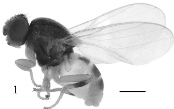
Fig. 1. Speccafrons digitiformis sp. nov. Male body, lateral view. Scale bar = 0.5 mm.

thick grayish microtomentum; first flagellomere as long as wide; arista brown except for basal segment yellowish brown, with short pubescence. Proboscis and palpus yellow with yellow setulae.