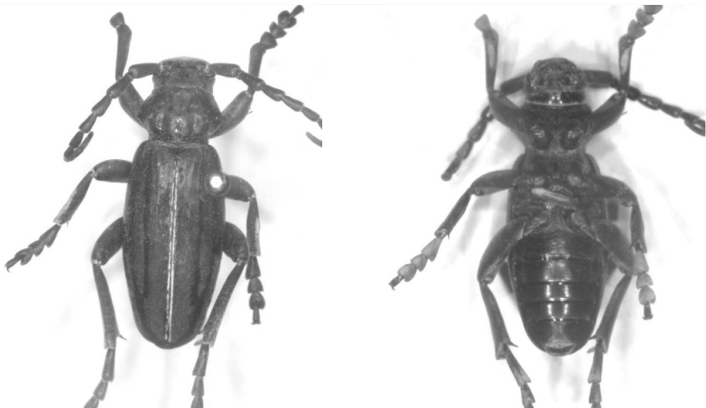
Fig. 1. Megalodorcadion nundefasciatum sp. nov. (holotype ♂).

Elytra with very dense, recumbent, dark-brown ground pubescence; each elytron with two glabrous bands as humeral and dorsal, and a distinct sutural band of white pubescence; glabrous bands complete; dorsal band separated from humeral band but joined at the end; elytra laterally glabrous; elytral apex without setae, flattened and rounded, reddish-brown.