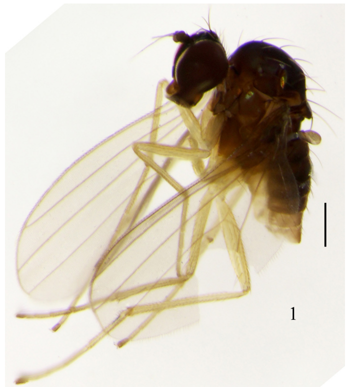
Fig. 1. Chrysotimus taiwanensis Wang & Yang, sp. nov., male: habitus, lateral view, scale bar = 0.4 mm.

Thorax metallic green with pale gray pollen, mesonotum and scutellum brilliant. Hairs and bristles on thorax brown; 4 dc, acr absent; scutellum with 2 pairs of bristles. Propleuron with 1 yellow bristle on lower portion. Legs including coxae yellow with 5th tarsomeres brown. Hairs and bristles on legs brownish; coxae with yellow hairs and bristles; fore coxa with 3–4 anterior and apical bristles, mid coxa with 2–3 anterior and apical bristles, hind coxa with 1 brown outer bristle near middle. Fore femur with 1 short av and 1 short pv apically; mid and hind femora each with 1 av and 1 pv apically. Mid tibia with 2 ad and 1 pd, apically with 4 bristles; hind tibia with 2 ad and 1 pd, apically with 3 bristles. Fore tarsomere 1 with row of 8–10 v, mid tarsomere 1