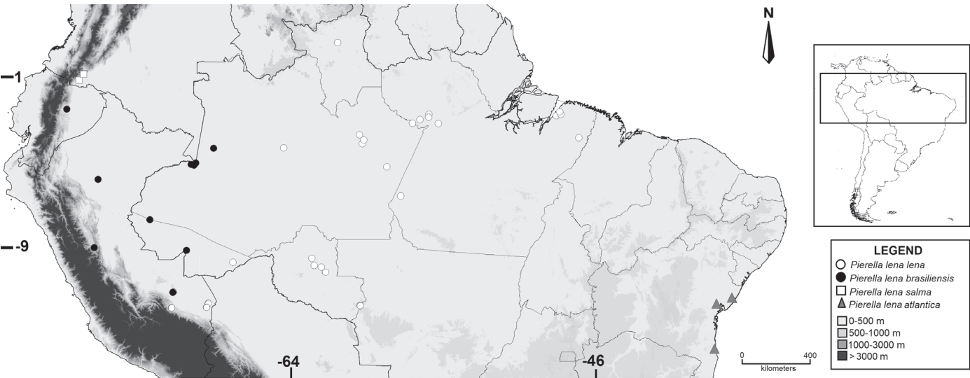
Fig. 3. Geographical distribution of the subspecies of Pierella lena based only on collection specimens