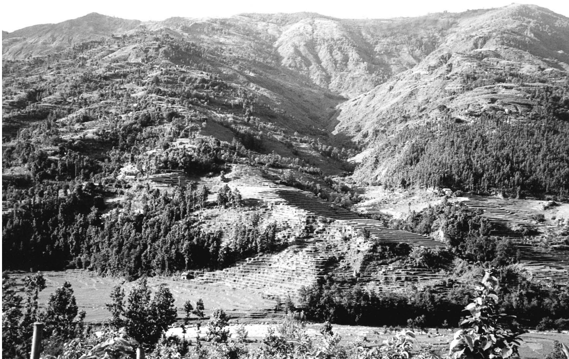
FIGURE 3 General view of the Dee subcatchment of the Likhu Khola (visible in the foreground), with khet terraces on the lower slopes and patches of woodland and bari terraces on the higher slopes. A few landslide scars are visible.

relatively gently outward-sloping rainfed terraces, frequently with a ditch at the back of the terrace to minimize overland flow and erosion. Khetland represents the system of irrigated terraces usually used for the growing of rice (Figure 4). It is important to make the distinction between double-irrigated and single-irrigated khetland. Double-irrigated khetland produces 2 rice crops, 1 during the premonsoon period and 1 during