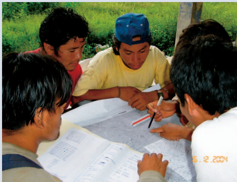
FIGURE 5 GPS training of future Park Guards.

“GPS is essential to locate the frontiers of community ownership and the reserve. It is difficult to know if a tree is inside or outside the protected area. In fact, GPS will allow us to observe infringements but also to record the habits of the fauna in the territory and the location of exceptional trees. This will enable us to protect them more effectively.” (William, a future ranger from San Isirio, at the December 2004 workshop)