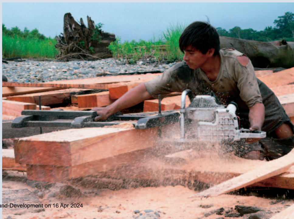
FIGURE 4 Woodcutting near the Madre de Dios River.