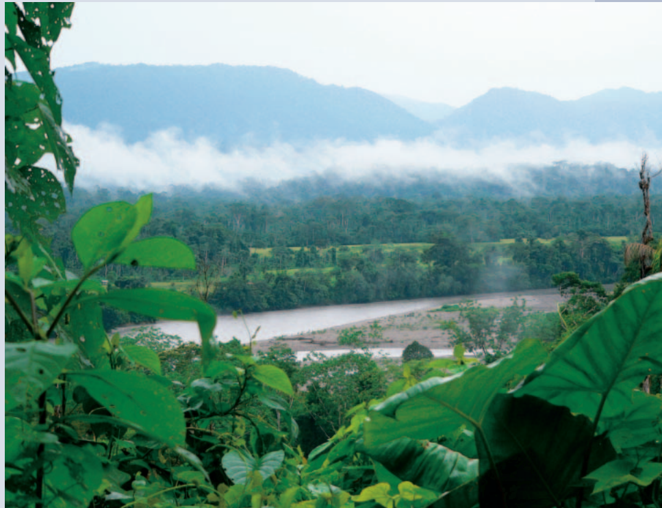
FIGURE 3 Along the road to Shintuya, between the Andes and the Amazonian basin.

as their duties. This is a cultural, economical and political challenge. Four main points have been identified with regard to the RCA's development: