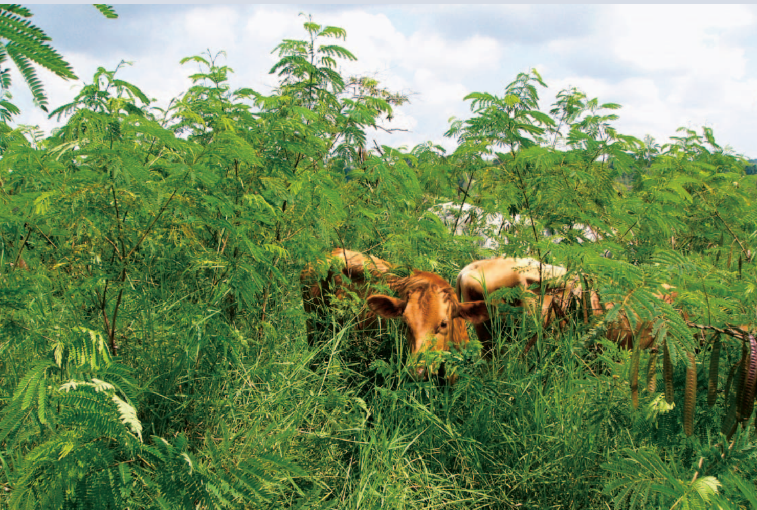
FIGURE 5 Silvopastoral practices introduce a variety of tree species in pasture. Here, cattle graze in an intensive leucaena or leadtree ( Leucaena leucocephala ) system in Quindío, Colombia. Such systems can be more productive and can harbor much higher levels of biodiversity than the extensive pastures they replace. However, high initial costs often make them financially unattractive to land users.

diversity than current monocultural, treeless pastures. Figure 6 shows initial data from biodiversity monitoring at the Costa Rica and Nicaragua sites. These results show that land used under a silvopastoral system harbors higher levels of biodiversity than treeless pastures. The observed diversity of bird species, as well as the number of individuals (not shown in Figure 6), is greater on land with trees, and higher yet when the tree density is higher. Similar results are being obtained for other indicators (vegetation, ants, and butterflies).