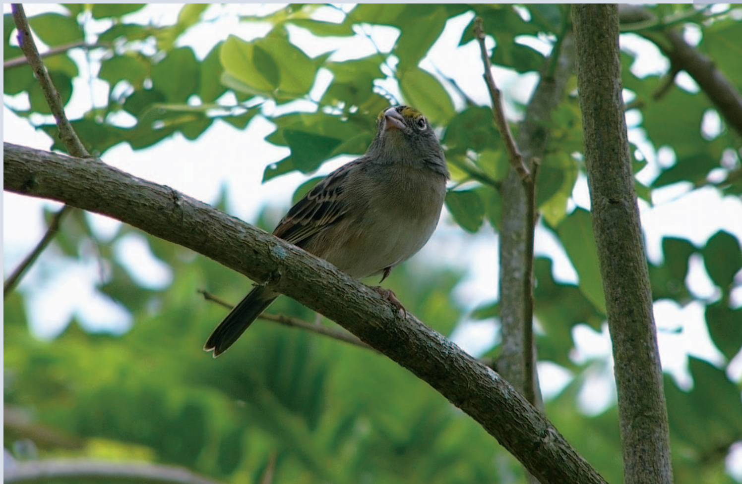
FIGURE 2 Coal miners have their canary, and the Silvopastoral Project has the sabanero grillo ( Ammodramus savannarum ). This critically endangered species was observed in a live fence planted under the Project in Quindío, Colombia.