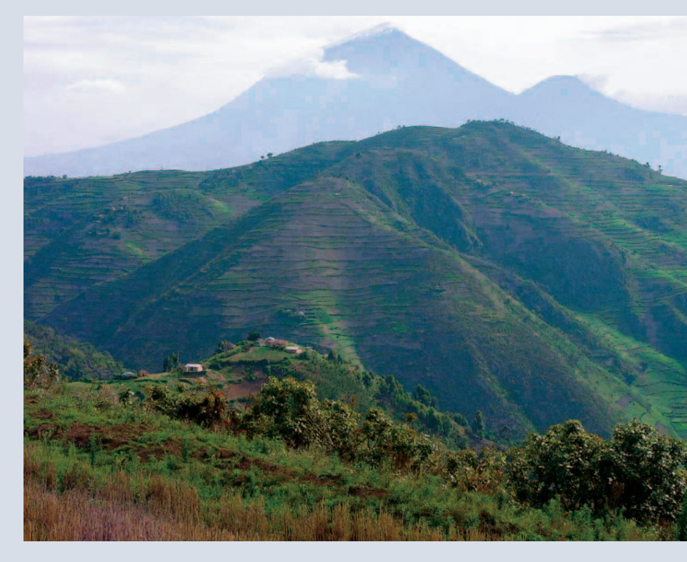
FIGURE 4 A typical view of the intensive agricultural land use on the steep Kigezi hills.

These patterns indicate that efforts to enhance tree cover and diversity may focus on intensifying tree planting on the back and foot slopes of the landscape, where