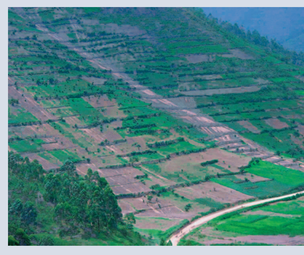
FIGURE 2 Sheet erosion on cultivated slopes. Promoting trees in heavily cultivated watersheds can reduce erosion and also create a habitat for biodiversity.

Our study confirms the active tree planting culture of Kigezi farmers in that 50% of trees inventoried on farms were deliberately planted. Planted trees are composed of 69% exotic and 31% indige-