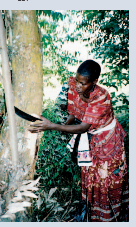
FIGURE 3 Farmers derive a large number of products and services from trees, including bark for traditional medicine.

nous species. Likewise, 49 species or 41% of the total of 119 woody species identified on the 80 farms studied were actively planted. As evidenced by the high percentage of tree coppicing, farmers also make intensive use of their trees for a range of wood uses including fuelwood, construction material, tool handles, household items, bean stakes, and nonwood uses such as animal fodder, fencing, fruits, and medicinal products (Figure 3). Household use and sale of these tree products make an essential contribution to their livelihoods.