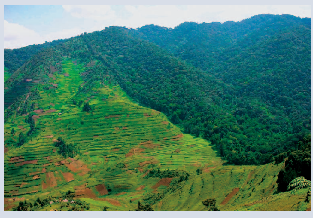
FIGURE 6 The sharp boundary between the Bwindi protected area and surrounding farmland shows the need for an integrated landscape conservation approach.

cultural extension, and the development of effective seed production and distribution systems.