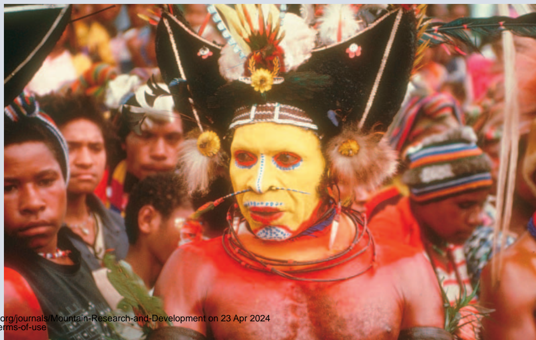
FIGURE 5 Huli tribesman. New Guinean tribes are a well-known example of extreme cultural diversity in a biologically very diverse environment.

versity inventories to socioeconomic analyses in order to formulate and begin to answer refined hypotheses regarding biocultural diversity. We will explore the role