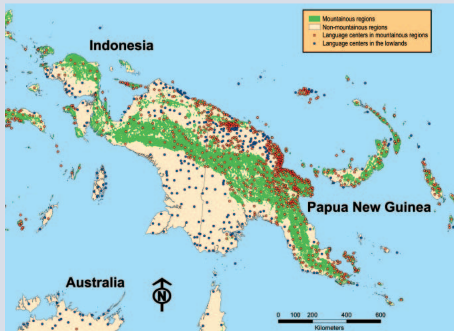
FIGURE 3 Distribution of languages in montane regions in New Guinea. (Map by authors)

sity and 2) explore reasons why this relationship occurs, and analyze the factors involved in both change and persistence of biocultural diversity. We have begun work on additional regional projects in mountainous areas, mainly in Mesoamerica and the Greater Himalayan region. Such a regional approach allows for more refined hypotheses and the incorporation of more detailed data. Especially with the regional level projects, we plan to identify patterns using a range of data from biodi-