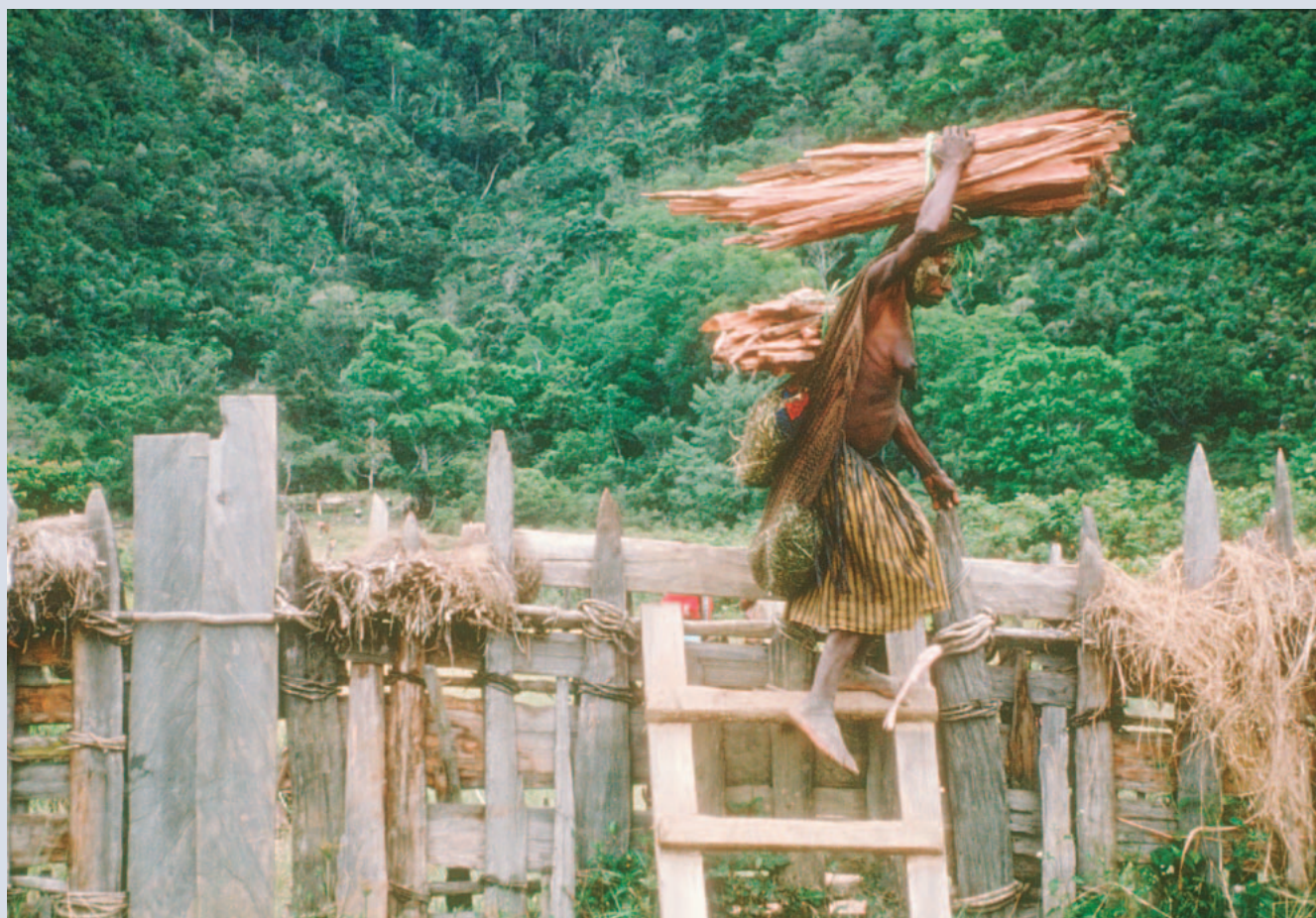
FIGURE 6 Firewood vendor in New Guinea; sustainable use of resources is a characteristic of mountain communities in this area of the world.

world, along with assessing their potential for appropriate and sustainable development.