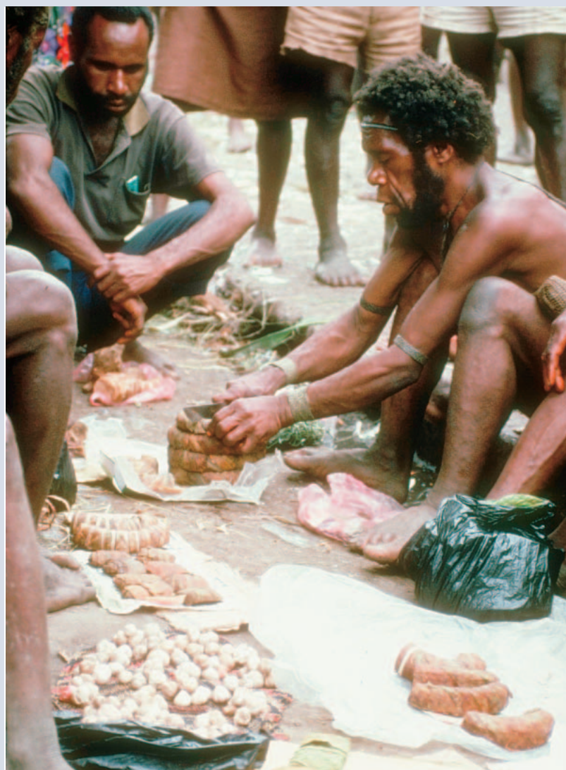
FIGURE 4 Tobacco merchant in New Guinea. Interestingly, exchange of goods in mountainous areas of the island of New Guinea has not led to loss of linguistic diversity.

of globalization, population growth, and land use/land cover change in biocultural diversity.