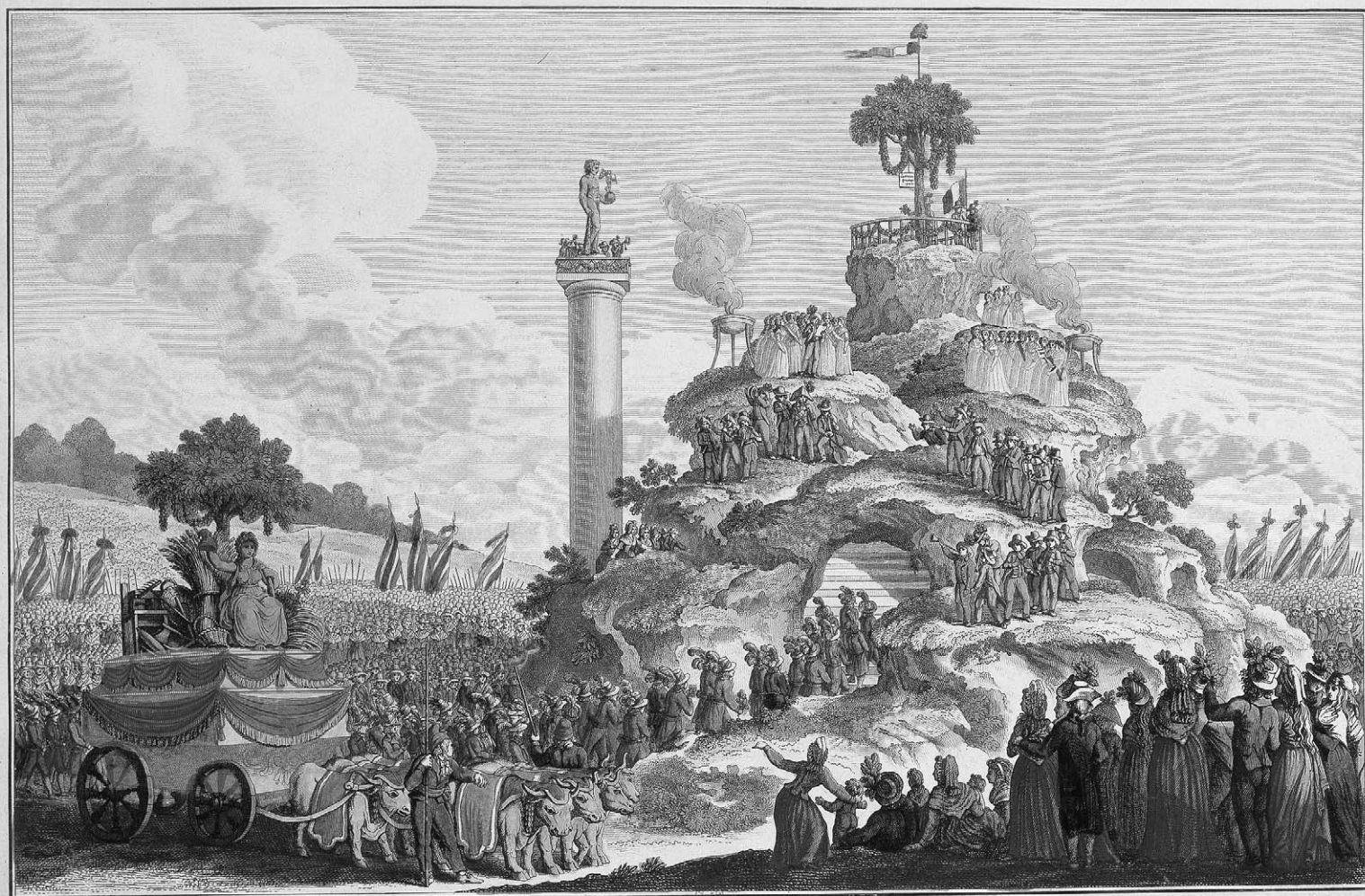
VUE DE LA MONTAGNE ÉLEVÉE AU CHAMP DE LA RÉUNION

pour la fête qui y a été célébrée en l'honneur de l'Être Suprême le Decadi 20 Prairial de l'an 2 me de la République Française.