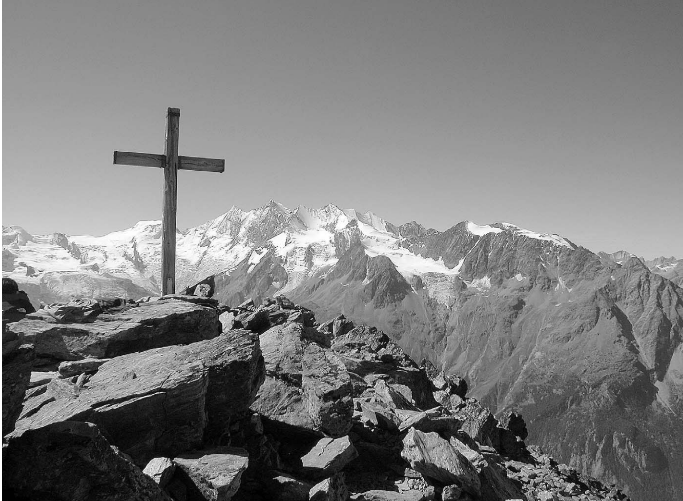
FIGURE 2 Christian cross on the Jegihorn in the Valais, Switzerland, late 20th century: a common feature in the European Alps.

must climb 4 nearby mountains with altitudes ranging from 970 to 1170 m within 24 hours and participate in the masses and devotions in the church buildings there. The Sacri Monti (artificially constructed holy mountains) at the southern foot of the Alps are also clearly related to topography. They developed in some regions near the border with Protestant countries during the decades around 1600. The idea of bringing “Jerusalem” to Europe and imitating it architecturally had already appeared before 1500 and gained greater significance after the Council of Trent (1545–1563). The thematic center of the Sacri Monti is formed by the life and the Passion of Christ on the mountain of Golgotha, or by remarkable scenes from the life of Mary, or the life of a saint. Here, as in other regions, it was often conspicuous but seldom very high mountains that received pilgrimage churches (Zanzi and Zanzi 2002).