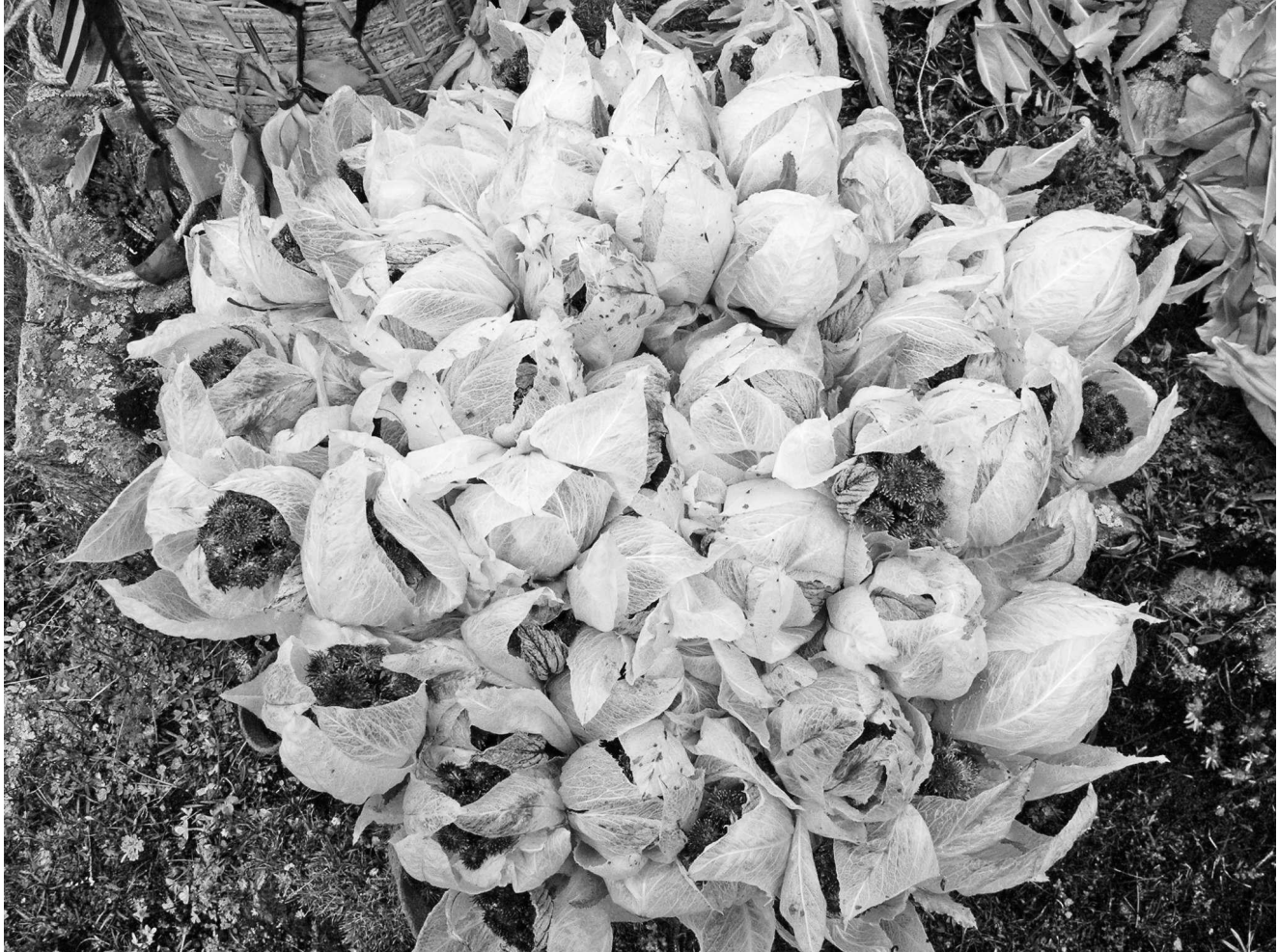
FIGURE 1 The sacred brahmakamal ( Saussurea obvallata ) is harvested only during the festival of Nanda Astami.

customary lifestyle of the inhabitants of the Askote Conservation Landscape (ACL). The taboo system surrounding sacred natural sites (sacred forests/groves, pastures, and water bodies) is described in greater detail below.