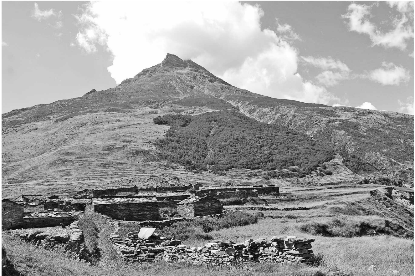
FIGURE 2 Bhujani, the sacred forest located above the village Martoli in Johaar Valley, remains the only refuge for the endangered species of musk deer ( Moschus chrysogaster chrysogaster ).

torulosa ), deodar ( Cedrus deodara ), bhoj patra ( Betula utilis ), or ratpa ( Rhododendron campanulatum ), or at higher altitudes by bil ( Juniperus communis , Juniperus indica ), which in turn are treated as sacred species.