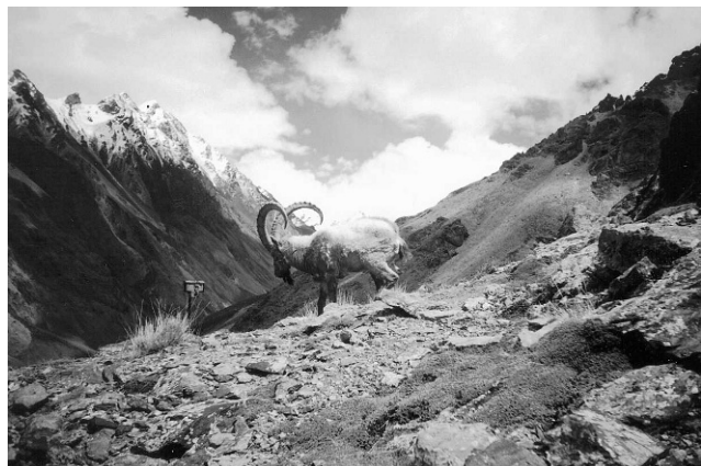
FIGURE 2 A Siberian ibex standing next to one of a pair of camera traps along a ridgeline.

the government (Braden 1984). The reserve was established for the protection of the alpine ecosystems of the Tien Shan and the rare species that occur there (specifically the snow leopard and the argali [ Ovis ammon ]). No hunting is permitted in SaryChat, although there are several villages located along the border, and extensive poaching by rangers and local villagers was previously reported (Koshkarev and Vyrpaev 2000).