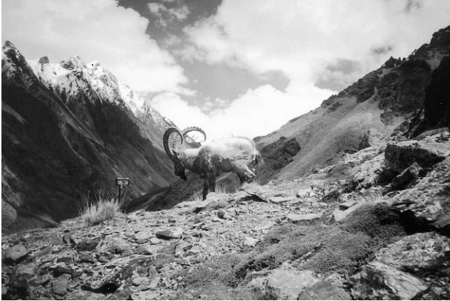
FIGURE 2 A Siberian ibex standing next to one of a pair of camera traps along a ridgeline.

the government (Braden 1984). The reserve was established for the protection of the alpine ecosystems of the Tien Shan and the rare species that occur there (specifically the snow leopard and the argali [ Ovis ammon ]). No hunting is permitted in SaryChat, although there are several villages located along the border, and extensive poaching by rangers and local villagers was previously reported (Koshkarev and Vyrypaev 2000).