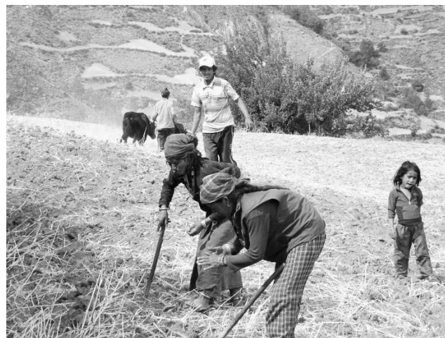
FIGURE 2 Dalit and Lama women, men, and a child involved in land preparation in Burgaon village.

them from going to school (Figure 2). Thus, the adaptive strategy of planting drought-resistant crops such as fapar reinforced gendered patterns of agricultural work, because women assumed a disproportionate share of farm production and household reproduction. The resilience of these gender practices shapes adaptive strategies and tends to maintain, if not exacerbate, the disadvantaged position of the women farmers under study.