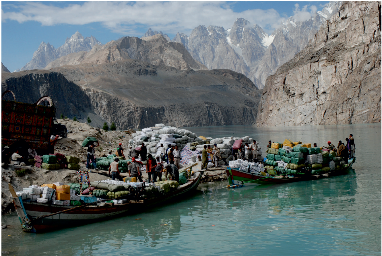
FIGURE 5 Porters transporting Chinese goods from trucks to boats at Hussaini port. (Photo by David Butz, July 2010)

pregnant wives south well in advance of delivery to be close to medical expertise in case an emergency situation arose. Such precautionary measures, however, do not resolve all health accessibility challenges; respondents mentioned 2 Gojalis—a driver injured in a car accident and a newborn baby—who died for want of emergency medical attention. In early 2011, the Rabita Committee of Gojal estimated that at least 13 people had died due to inaccessible healthcare since the landslide (Pamir Times 2011b). Fourteen more perished after a vehicle crash in August 2012.