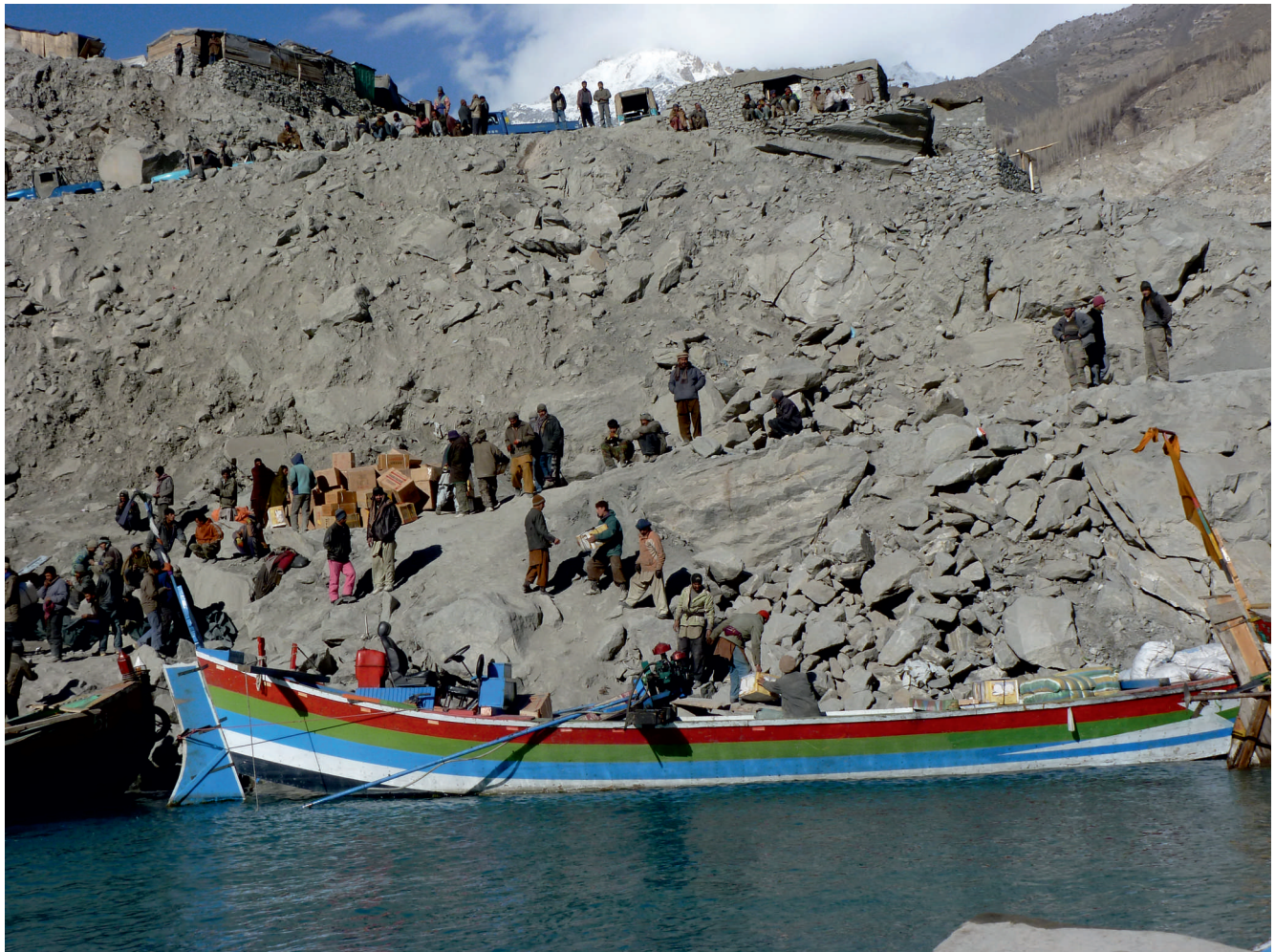
FIGURE 4 Boat passengers disembarking at Atta Abad landslide deposit. (Photo by David Butz, November 2012)