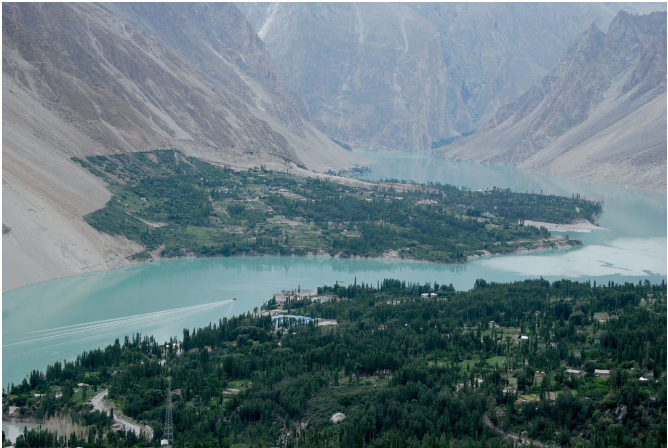
FIGURE 3 Partially flooded villages from above Gulmit. (Photo by David Butz, July 2011)

and off-farm employment became the basis of people's livelihoods. The network of high paths fell into disrepair as fewer people visited the alpine pastures and travel between villages shifted to the KKH or tributary roads along valley floors. Gojalis became accustomed to road transportation and reliant on the cheap and easy movement of people and commodities that the KKH enabled.