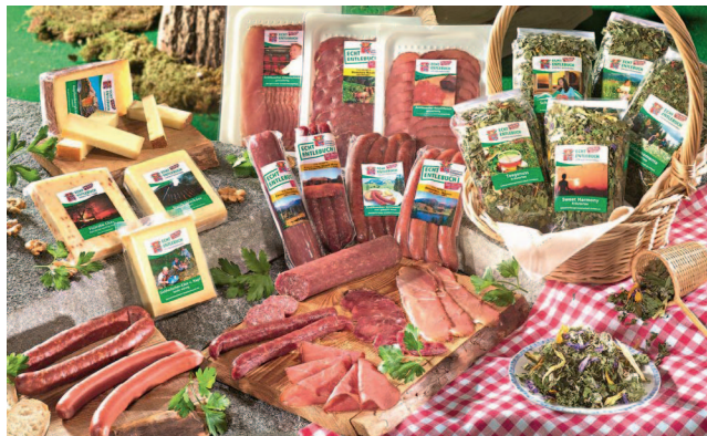
FIGURE 4 A selection of labeled products sold in supermarket chains in Switzerland.