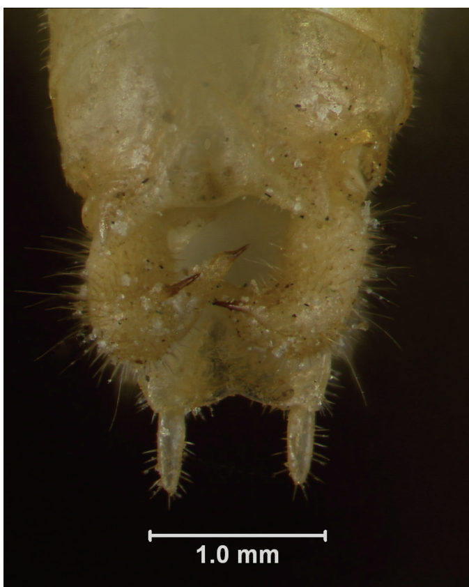
Fig. 2. Terminalia of holotypic male. The cerci are above the subgenital plate and its cylindrical styli. Each cercus has two subapical spines. The outer spine has a minimal basal piece whereas the inner spine has a substantial one (the inner spine of the right cercus is not visible in this image).

Habitat/behavior. — At Kitt Peak, 7Jun2013, all males and females were on perennial bunch grasses in open, mixed grass-shrub habitat;