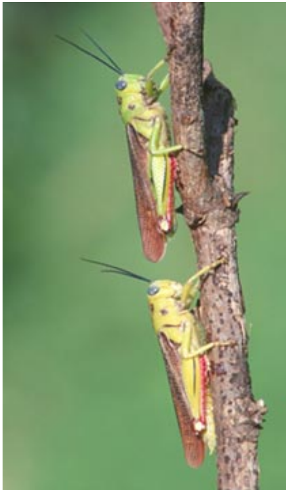
Fig. 3. Mature males reared under different moisture.