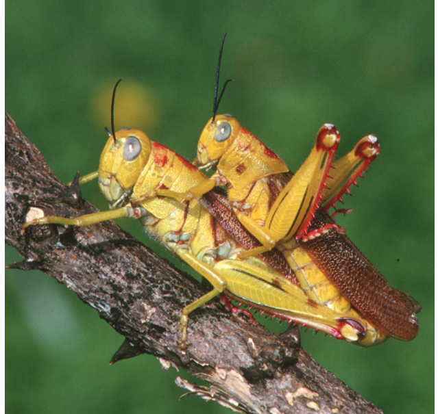
Fig. 2. Senescent adults.