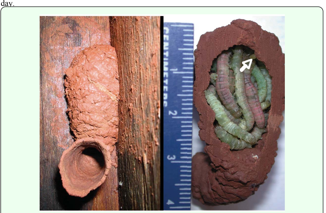
Figure 1. (Left) A single-celled nest of Abispa ephippium was occupied by a Pseudabispa paragioides female when discovered in 2004. (Right) After removal from substrate, the nest was found to contain an egg (arrow) and 20 caterpillars mass provisioned by the P. paragioides female. High quality figures are available online.

In 2004 we captured, marked, and released 47 wasps; two of these were P. paragioides . Both were males; the first was caught on 30 November and the second on 2 December. Both were flying in the carport, one at 09:12 hours and the other at 15:45 hours. The latter was recaptured twice, once at a nearby small pond six days later and again a day later in the carport.