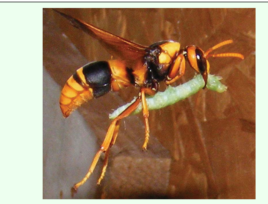
Figure 3. Pseudabispa paragioides returning to the focal nest with caterpillar prey. Note that her front legs are not used to support the prey during transport. High quality figures are available online.

Figure 2. A marked female of Pseudabispa paragioides (top) in a battle with the female of Abispa ephippium (below) that owned the focal nest observed in 2007; shortly after this photograph was taken, the A. ephippium female died and P. paragioides occupied her nest. Note the similarity in size and coloration of the two species. High quality figures are available online.