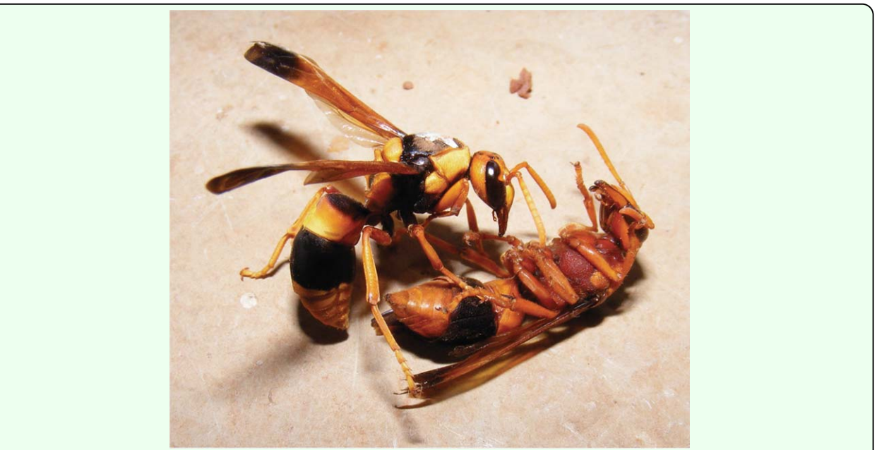
Figure 2. A marked female of Pseudabispa paragioides (top) in a battle with the female of Abispa ephippium (below) that owned the focal nest observed in 2007; shortly after this photograph was taken, the A. ephippium female died and P. paragioides occupied her nest. Note the similarity in size and coloration of the two species. High quality figures are available online.

After closing this cell, the wasp began to work