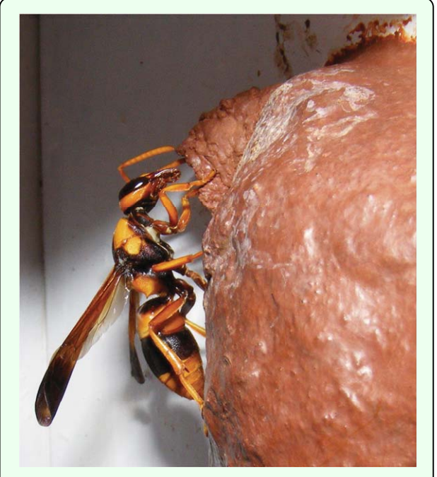
Figure 4. Pseudabispa paragioides obtaining mud from the remains of the nest funnel originally constructed by Abispa ephippium . The mud was used to close a newly provisioned cell elsewhere on the nest (out of view). High quality figures are available online.

on the original but now empty cell 6, vigorously cleaning out debris that accumulated on the floor below the nest. This occurred over two extended bouts, during which she repeatedly (40+ times) entered head first and then backed out far enough to drop debris over the cell entrance. Following this, she worked at the entrance rim, rapidly opening and closing her jaws as part of repeated head-bobbing movements while she slowly rotated her body around the entrance rim. She was not obviously applying anything and her jaw tips appeared to barely contact the nest, but she spent a lot of time repeating this behavior, which was punctuated by breaks to crawl into the cell and remove more small pieces of debris and by brief grooming episodes. She gripped the nest primarily with her hind tarsi. This cell preparation stage extended over two