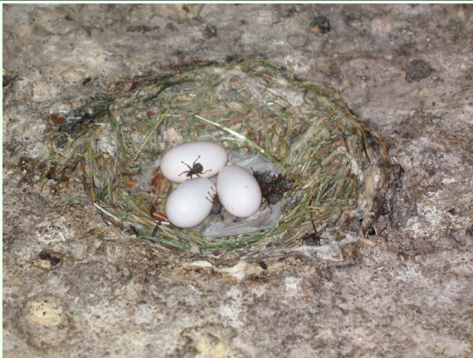
Figure 2. Adult Crataerina pallida at the nest during the incubation period of the Apus apus eggs. High quality figures are available online.

Adults emerged from 9 of the 20 pupae kept at room temperature between 27 April and 02 May, somewhat earlier than what would be expected. The group kept in the refrigerator hatched between August and October