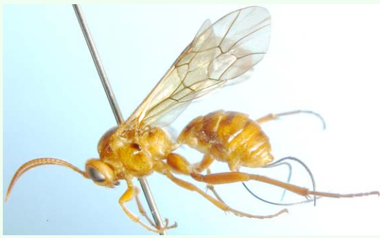
Figure 1. Laxiareola ochracea Sheng and Sun, gen.sp.nov. Body, lateral view. High quality figures are available online.