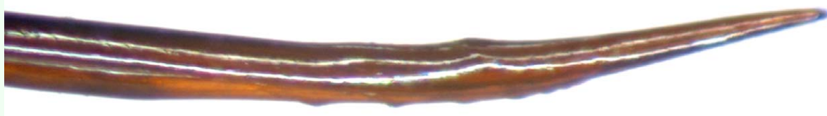
Figure 5. Laxiareola ochracea , Ovipositor. High quality figures are available online.

Area externa with distinct punctures. Residual portion with indistinct fine punctures. Propodeal spiracle oval, slightly raised.