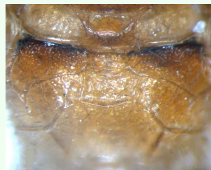
Figure 4. Laxiareola ochracea , Propodeum. High quality figures are available online.