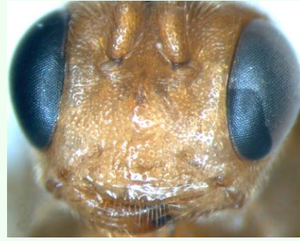
Figure 2. Laxiareola ochracea , Face. High quality figures are available online.

approximately 0.65 times as long as forewing. Scape almost cylindric, approximately 2.3 times as long as its widest diameter; apical truncation nearly transverse; with 24 flagellomeres, ratio of length from flagellomere 1 to 5 in proper order: 4.0:3.8:3.6:3.4:3.2. Occipital carina complete, middorsal portion approximately horizontal.