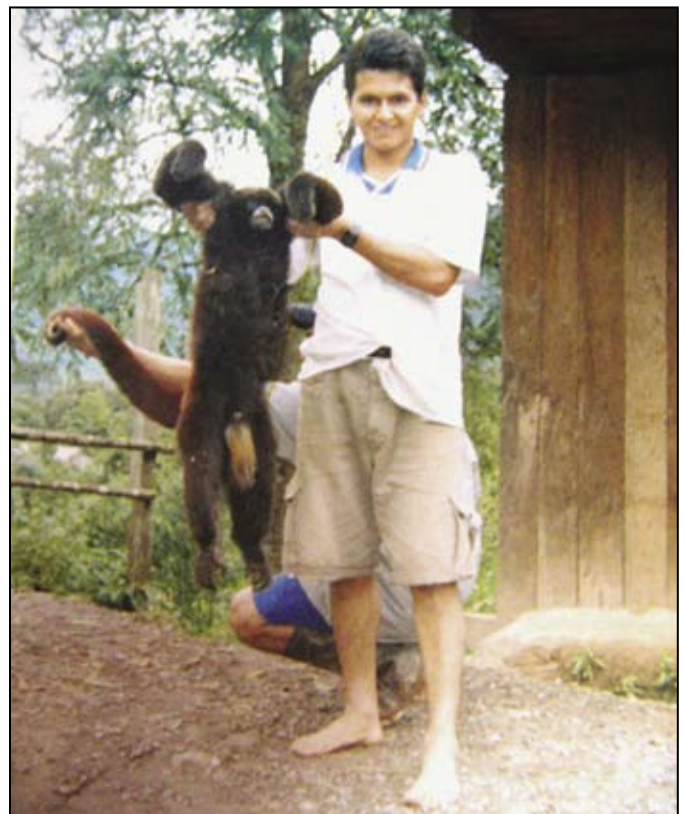
Figure 3. A farmer poses with a recently killed adult male Oreonax flavicauda , near the settlement of Afluente (Alto Mayo), Peru.

The campesinos of this area, and in all areas in the Bosque de Protección, are immigrants, former cerranos (people from the sierras) who fled to the area during the height of guerilla activity (mostly the Sendero Luminoso) during the 1970s and 80s. The prospect of free and unoccupied terrain enticed them further still and stimulated a greater influx that is still growing at an exponential rate. Most of the occupation occurred before the Bosque de Protección was decreed in 1987, but settlers continue to migrate to the area. As a result, the Department of San Martín has the third highest population growth rate in the country (4.7% over 10 years: Instituto Nacional de Estadística e Informática [INEI]—Estimaciones de Población por Departamentos, Provincias y Distritos, 1995–2000; San Martín, Peru).