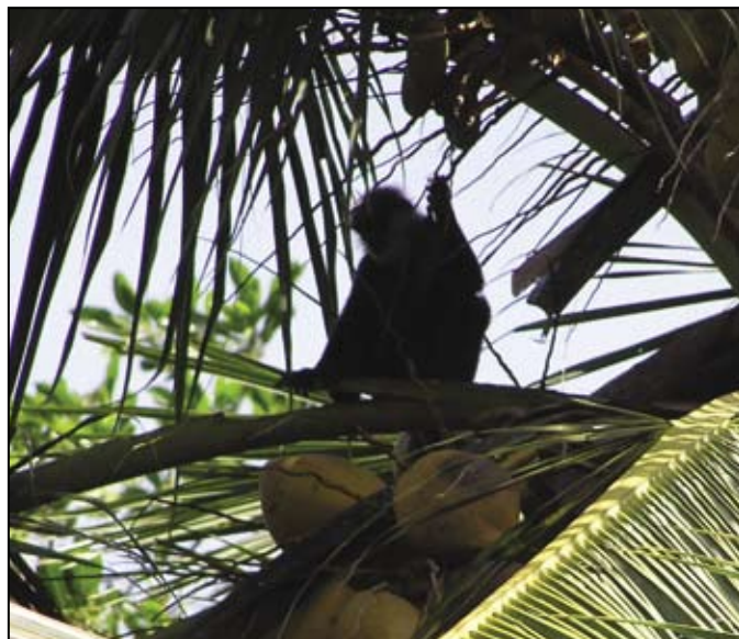
Figure 3. A juvenile western purple-faced langur, Trachypithecus vetulus nestor , resting in a coconut palm.

to be taking place more rapidly in the eastern than the western half, and these reductions suggest the occurrence of local extinctions. For instance, although Hill (1934) mentioned T. v. nestor 's presence several decades ago at localities such as Kitulgala and Ruwanwella, it was recorded as absent at these sites during the survey. Moreover, the sites in the eastern half where it was seen or recorded as present during interviews were interspersed between areas where it was absent or rare. Hence, the status of T. v. nestor at the sites surveyed (i.e., present, absent or rare) also suggests the occurrence of local extinctions. Local extinctions in the western half appeared to be mostly along the north-east boundary where it may have occurred in low numbers in the first place, but local extinctions in the eastern half appear to have progressed well inside its former haunts (Fig. 1, inset).