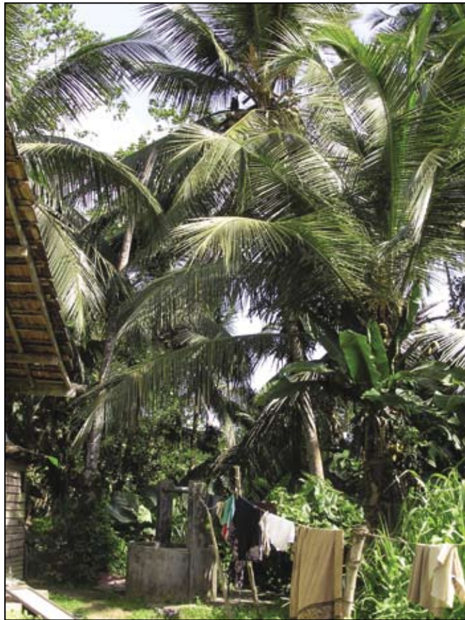
Figure 2. A garden—the predominant habitat type within the current range of the western purple-faced langur, Trachypithecus vetulus nestor .

The western purple-faced langur was seen or recorded as present only in 43% of the sites surveyed in the eastern half of its historical range ( N = 23 ), and 78% of the survey sites in the western half ( N = 27 ). At other sites in both halves, T. v. nestor was recorded as rare or absent. Thus range reduction seemed