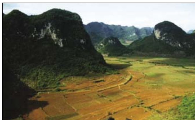
Figure 1. The topography and fragmentation of karst hills in habitat of white-headed langur.

The study was carried out in three nature reserves: Longgang National Nature Reserve on the borders of the counties of Longzhou and Ningming; Chongzuo Banli Provincial Nature Reserve in Chongzuo County; and Fusui Papen Provincial Nature Reserve in Fushui County in the southern Guangxi Province (Fig. 2). This covers the entire known range of the wild population of the white-headed langur. Average