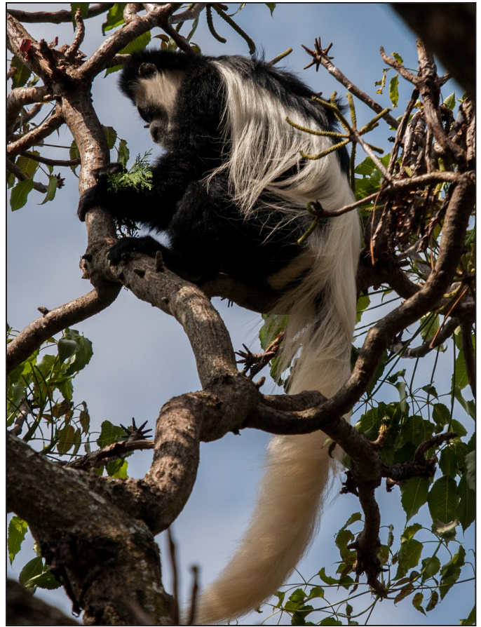
Figure 6. Adult male Mount Kilimanjaro guereza Colobus guereza caudatus , Loitokitok, southeast Kenya. For additional images and localities for C. guereza , visit the 'Colobinae Photographic Map' at < www.wildsolutions.nl >.

(Rodgers 1981; Cordeiro et al. 2005; Doggart et al. 2008; T. M. Butynski and Y. A. de Jong pers. obs.). The absence of C. guereza and C. angolensis from the North Pare Mountains is unexpected given the proximity of these mountains to populations of these two species; C. guereza at Kileo and Kitobo c. 15 km to the northwest, and C. angolensis in the South Pare Mountains c. 7 km to the southeast.