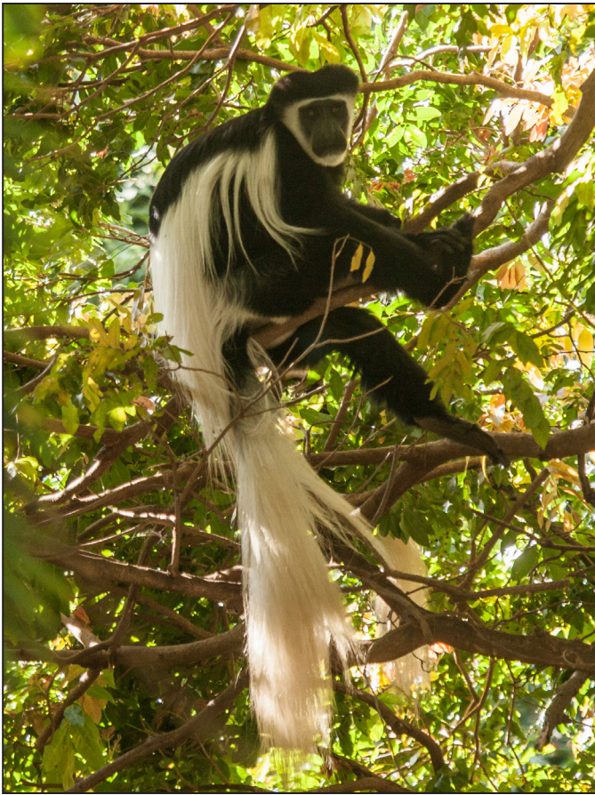
Figure 5. Adult male Mount Kilimanjaro guereza Colobus guereza caudatus , Kitobo Forest Reserve, southeast Kenya.