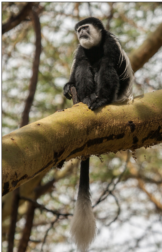
Figure 1. Adult male Mau Forest guereza Colobus guereza matschiei , Lake Naivasha, southwest Kenya. In this subspecies, 36–57% of the tail is white.