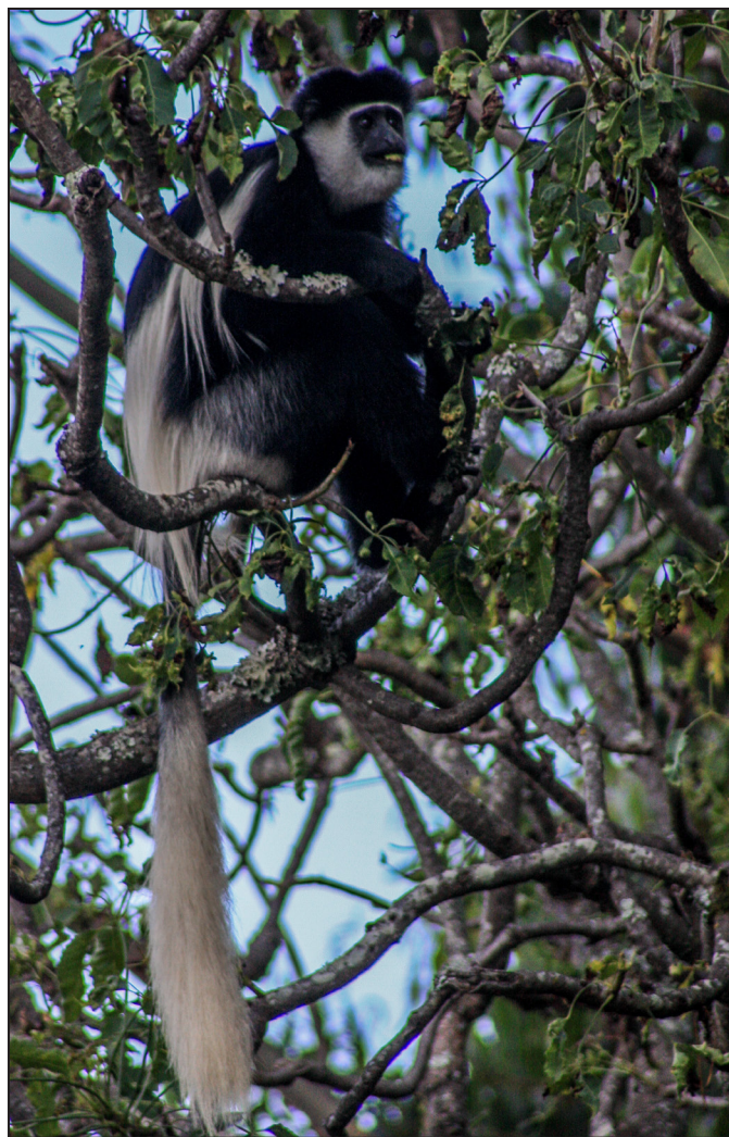
Figure 2. Adult male Mount Kenya guereza Colobus guereza kikuyuensis , Nanyuki, central Kenya. In this subspecies, 71–81% of the tail is white.

Primate surveys were conducted 27–28 September 2014 from a vehicle and on foot by the two authors. Transects were run along dirt roads and foot paths. These were selected to maximize the chances of encountering as many individuals of as many species of primate as possible. As time was very limited, the rapid assessment survey method was used, as described in Butynski and Koster (1994), White and Edwards (2000), and Butynski and De Jong (2012).