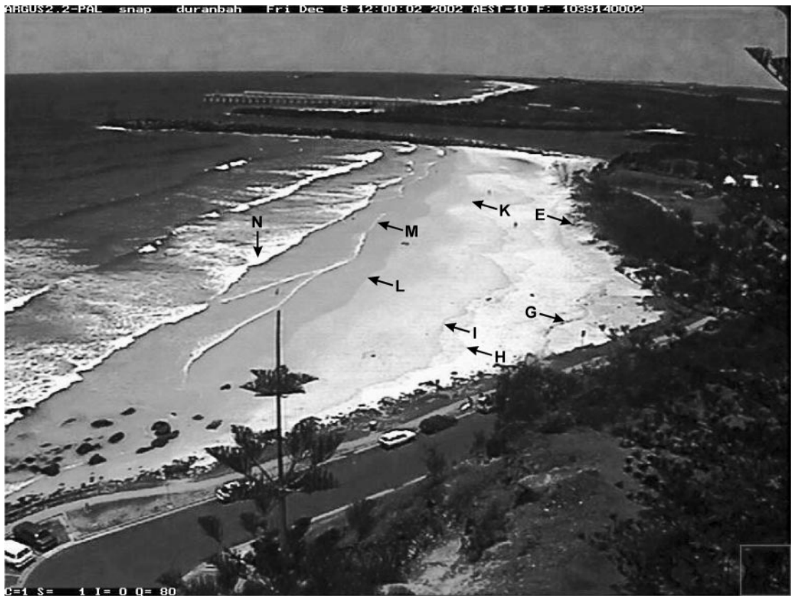
Figure 2. An example of a range of visibly discernible shoreline indicator features, Duranbah Beach, New South Wales, Australia. For key, see Figure 1.