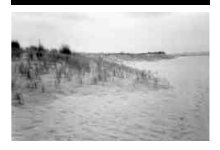
Figure 14. Grazing in Isla Cristina beach (Spain).