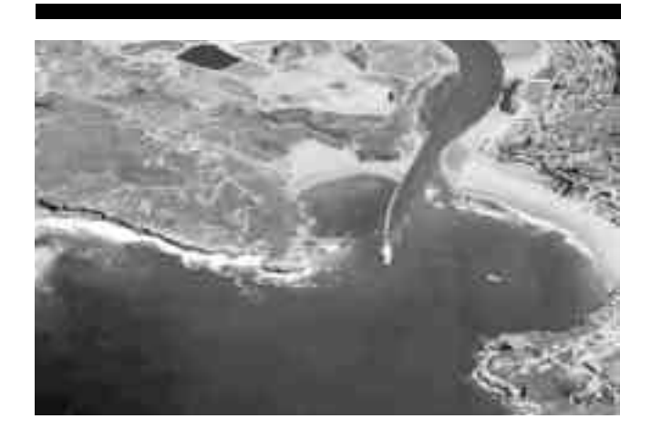
Figure 9. An aerial view of Cuchía beach (Cantabrian, Spain)

Figure 9 shows an aerial view of Cuchía beach and Suances estuary. A panoramic of Cuchía beach after rehabilitation is depicted in Figure 10.