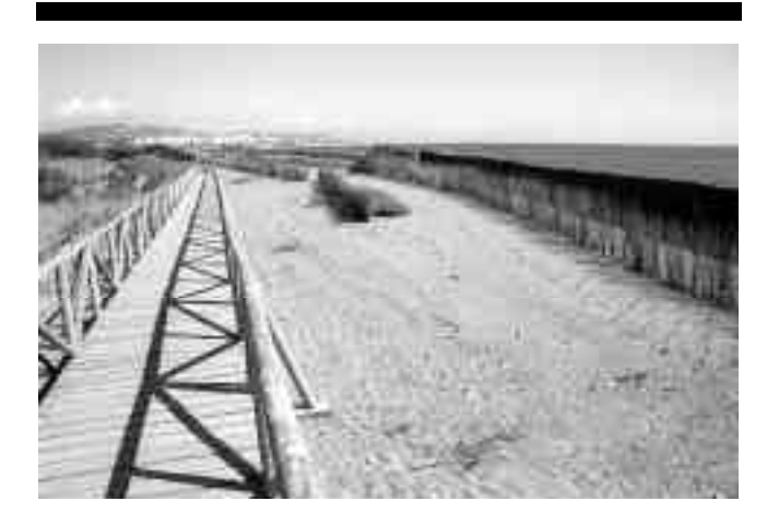
Figure 20. A detailed view of Guadalquitón dune restoration (Cádiz, Spain)