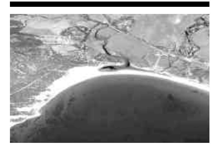
Figure 16. An aerial view of Valdevaqueros cove (Cádiz, Spain)

The relatively high longitudinal net sediment transport along the Huelva coast (up to 400,000 m³/year eastward) together with littoral drift interruption by the harbour entrance jetties, decrease sediments by river discharge and urbanisation developed too close to the beach generally expose Huelva beaches and foredunes to high erosive rates. Isla Cristina beach is one of the representative Huelva tourist beaches showing beach and foredune erosion due to the conjunction of the aforementioned causes and in particular to the interruption of the littoral drift