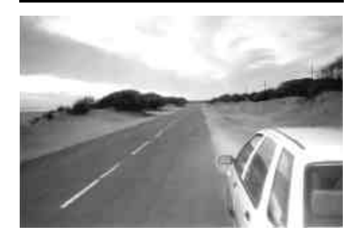
Figure 2. Existing road alongside La Bota beach (Huelva, Spain), Gómez-Pina 1997.