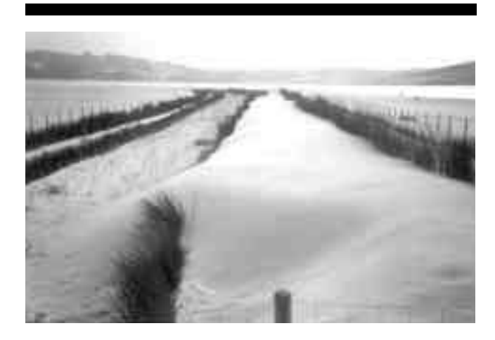
Figure 7. A detail of dune restoration in Liencres spit (Cantabrian, Spain)