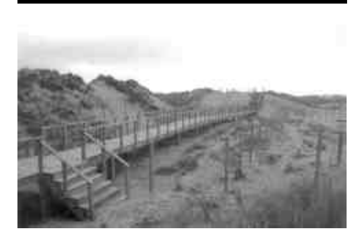
Figure 8. Dune walkover and fencing in Liencres spit (Cantabrian, Spain)

Figure 6 depicts an aerial view of Liencres spit after dune breaching. In Figure 7 sand accumulation caused by willow fences can be seen. Elevated dune walkovers and fencing are shown in Figure 8.