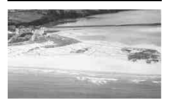
Figure 4. An aerial view of Somo spit (Cantabrian, Spain) after dune restoration.

Liencres spit, located in the mouth of the Pas river and is one of the most important spit formations in the Cantabrian sea, not only for its dimensions but also for its natural and ecological value. The Liencres' wide dune system has suffered a continuous process of degradation due to former extensive sand mining, excessive tourist pressure and also from the occurance of several unfavourable wind, tides and storm events. As a result, the seaward dune face was undermined and collapsed, loosing vegetation and becoming very vulnerable. Dune restoration works ended in 1999 consisting, as in Somo spit, of the use of sand trappers, transplanted vegetation, fencing, walkover construction and educational posters.