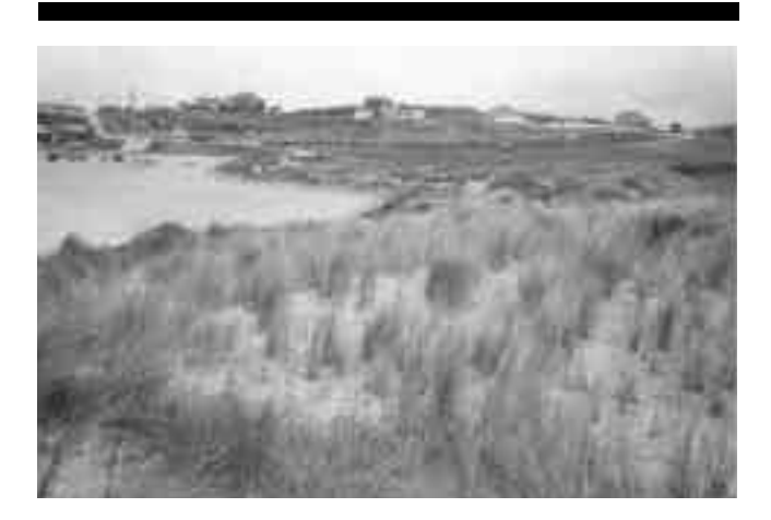
Figure 10. Cuchía beach (Cantabrian, Spain) after dune restoration