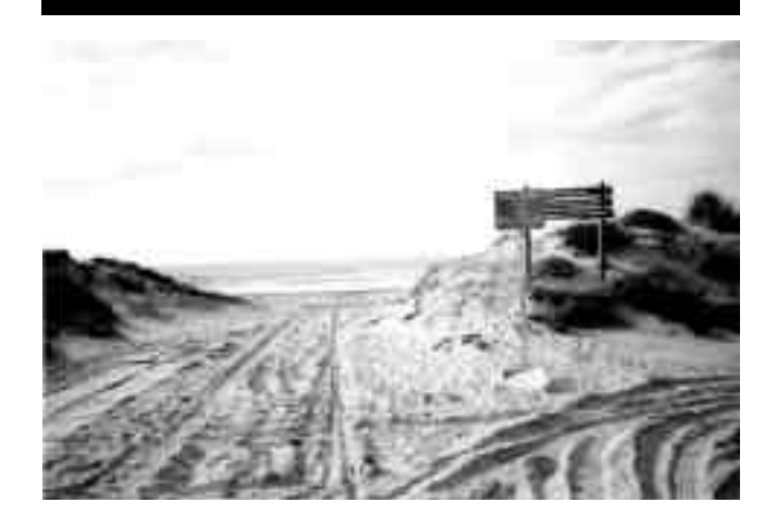
Figure 1. Typical dune breaching in La Bota (Huelva, Spain), Gómez-Pina 1997

Figures from GÓMEZ-PINA(1999) are representative of dune degradation in La Bota beach (Huelva). Figure 1 shows a typical dune breach caused by off-road vehicles and human trampling. Figure 2 depicts the existing public road, crossing the foredunes longitudinally. The removal of this road is part of a very ambitious integrated dune management project being carried out by the National Spanish Coast Directorate, Ministry of Environment.