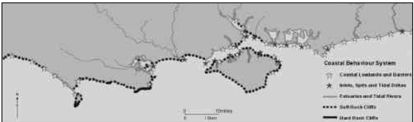
Figure 2. Distribution of SCOPAC Coastal Behaviour Systems